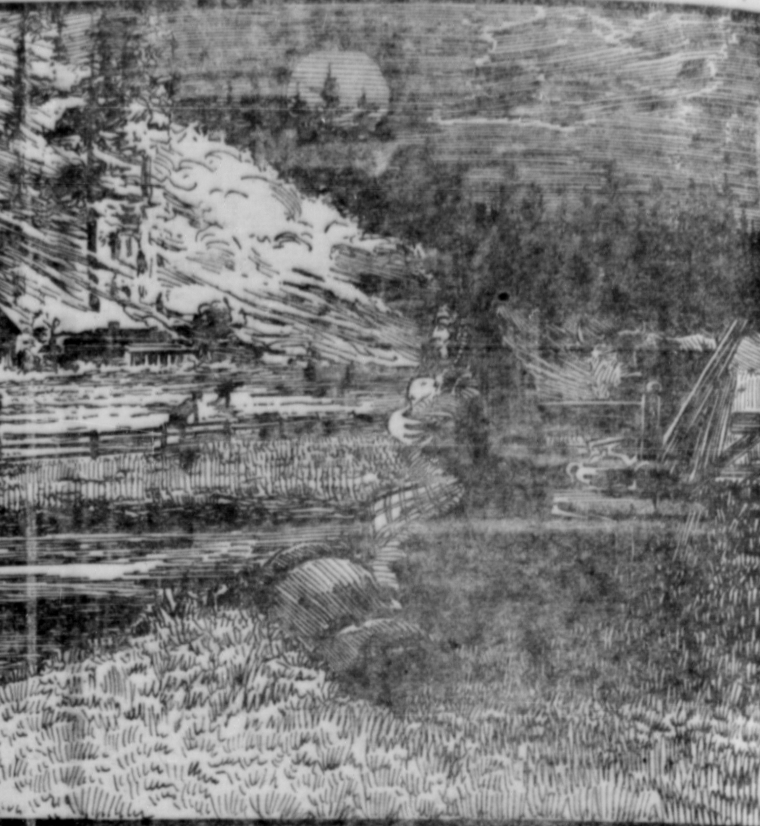
One Reason Why.