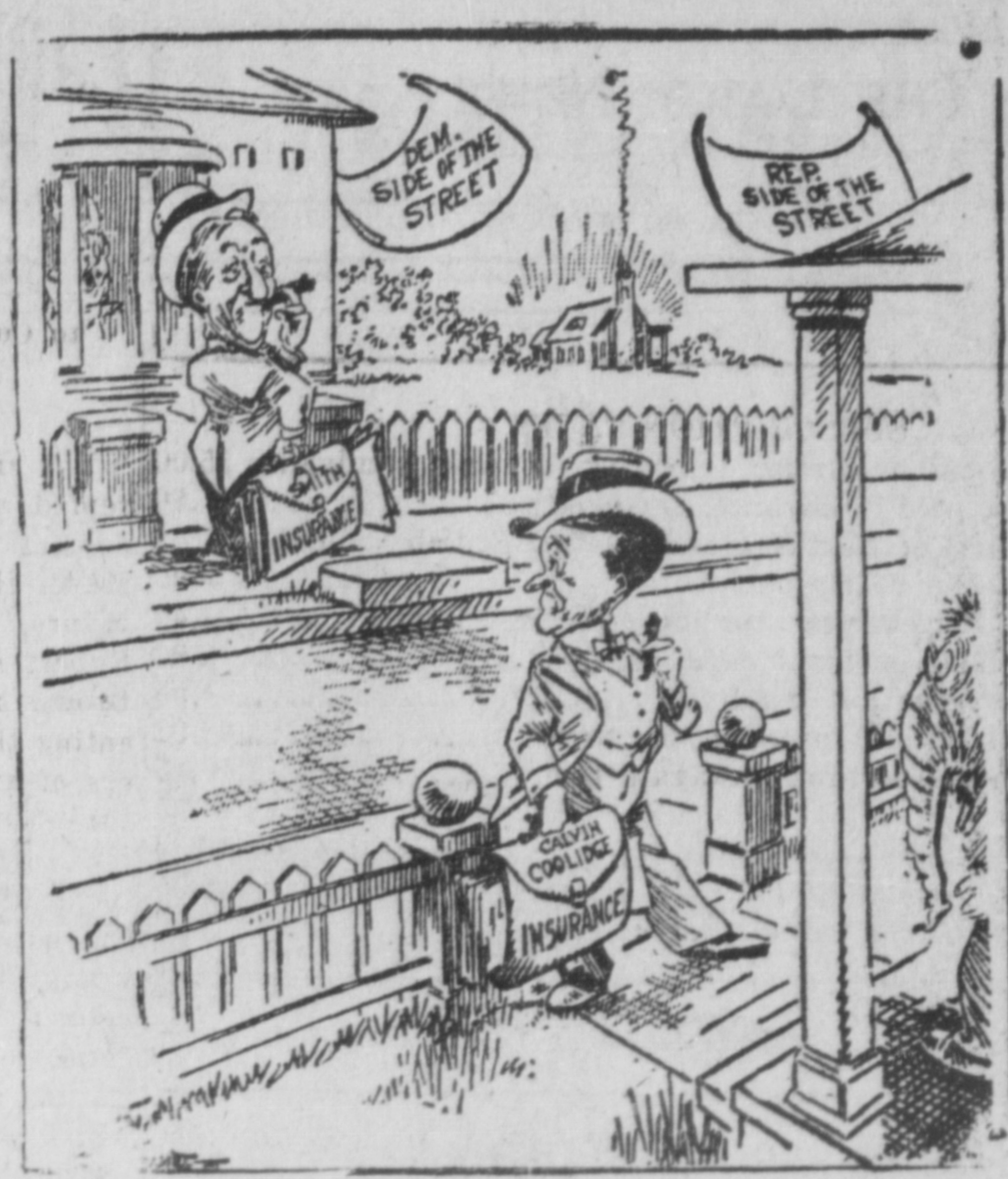
ANOTHER CAMPAIGN UNDER WAY —Talburt in the New York Telegram

Our classified section may be of special interest to you today.