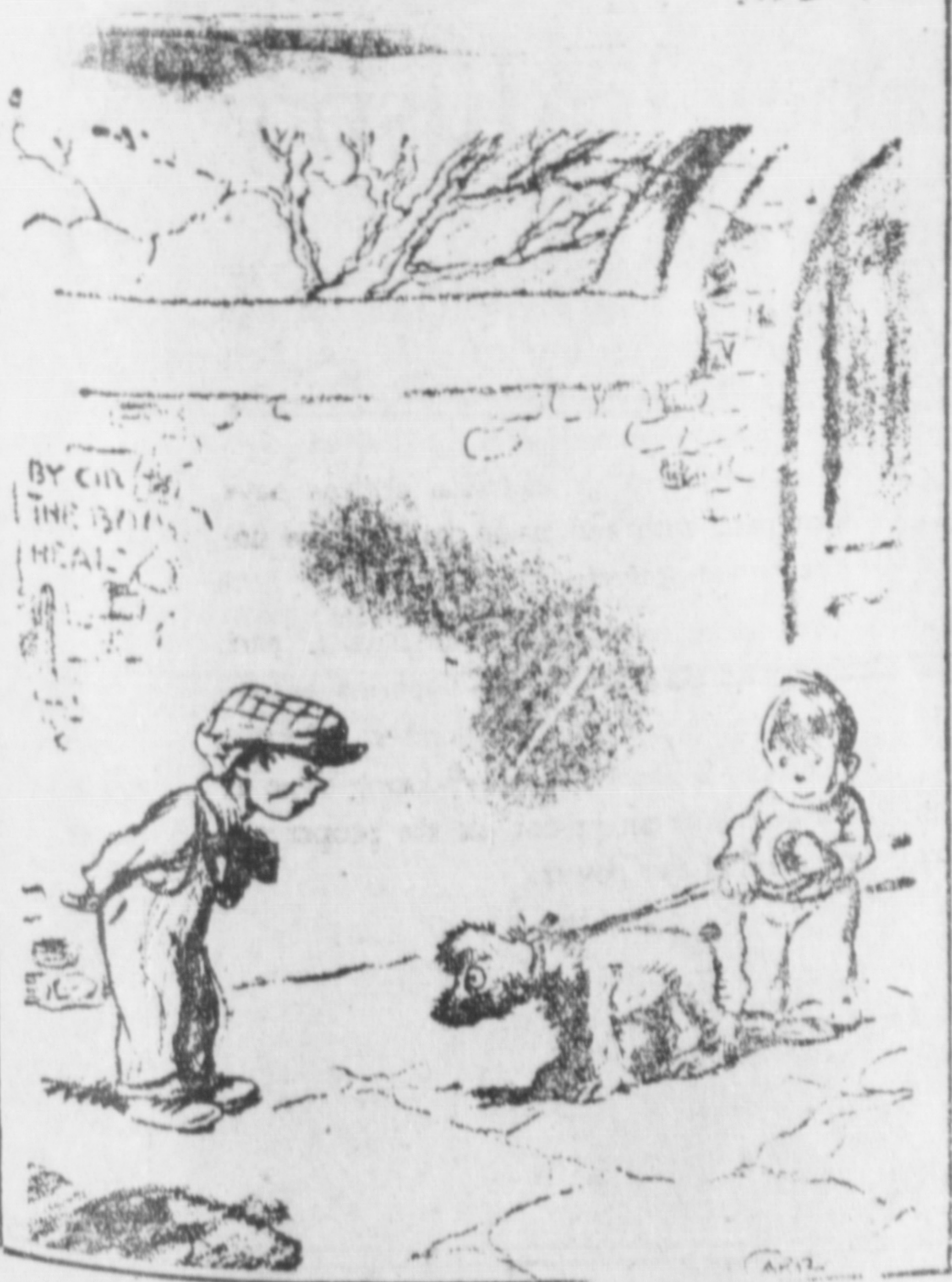
"Ow can you feel when 'e's 'appy with that little tail?" —The Passing Show, London.