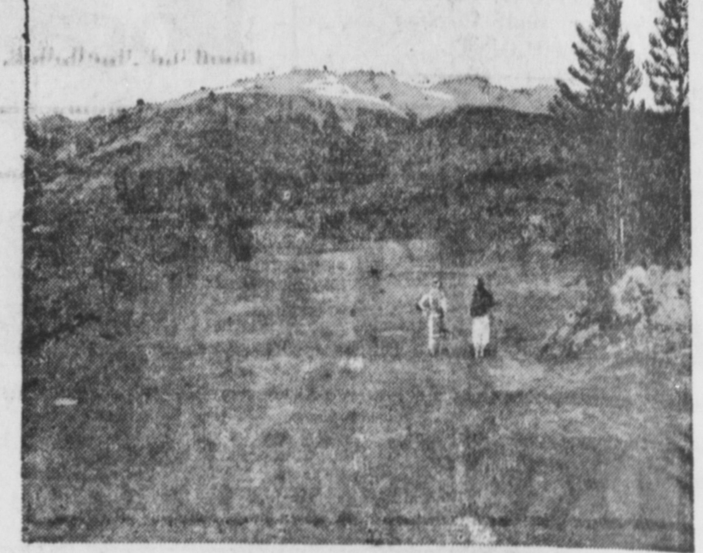
No. 8, Tekarra's Cut—430 yards, Par 4.