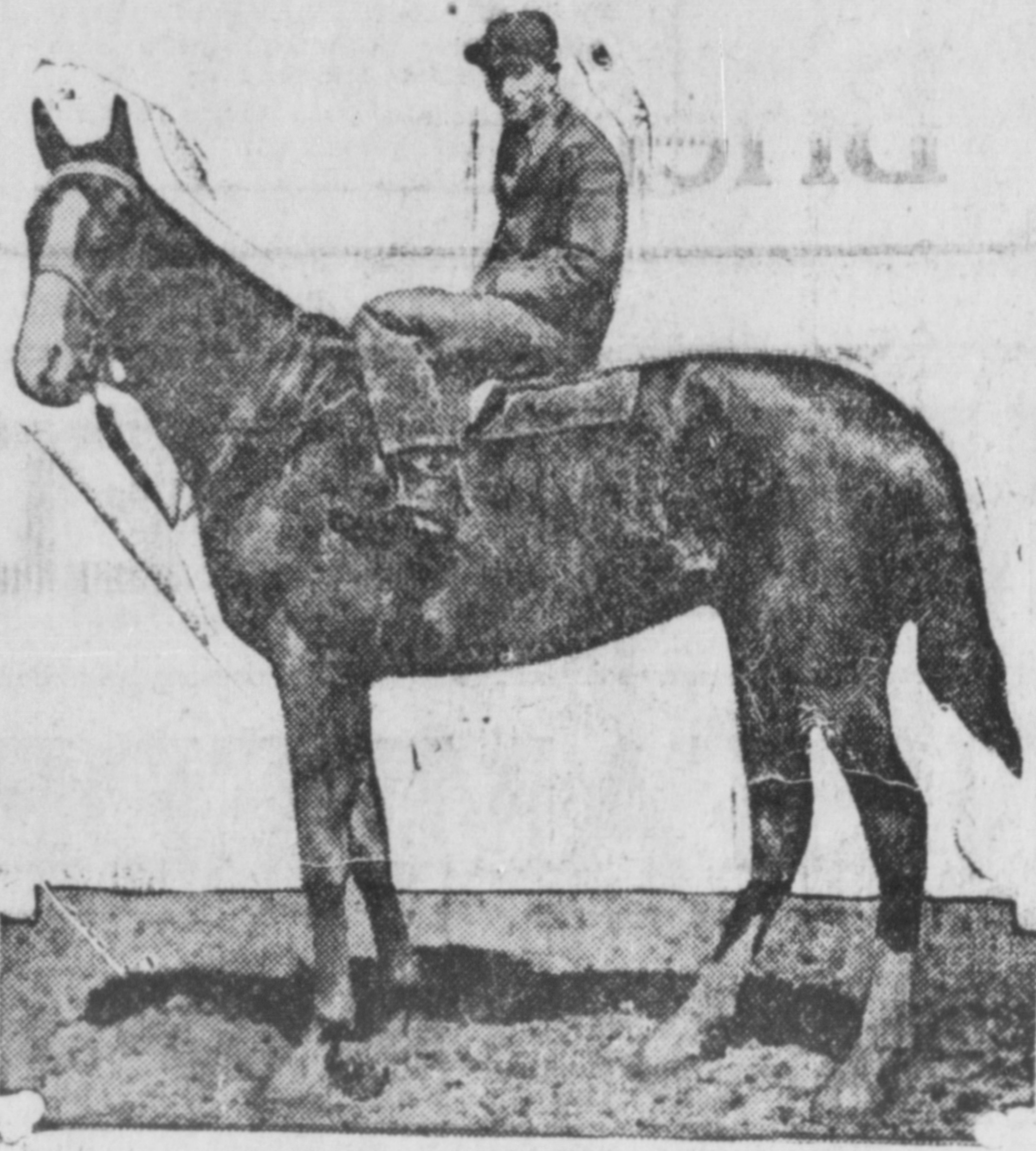
KENTUCKY DERBY RUNNER

"Highway" was one of the entrants in the race Saturday which was won by Clyde Van Dusen.