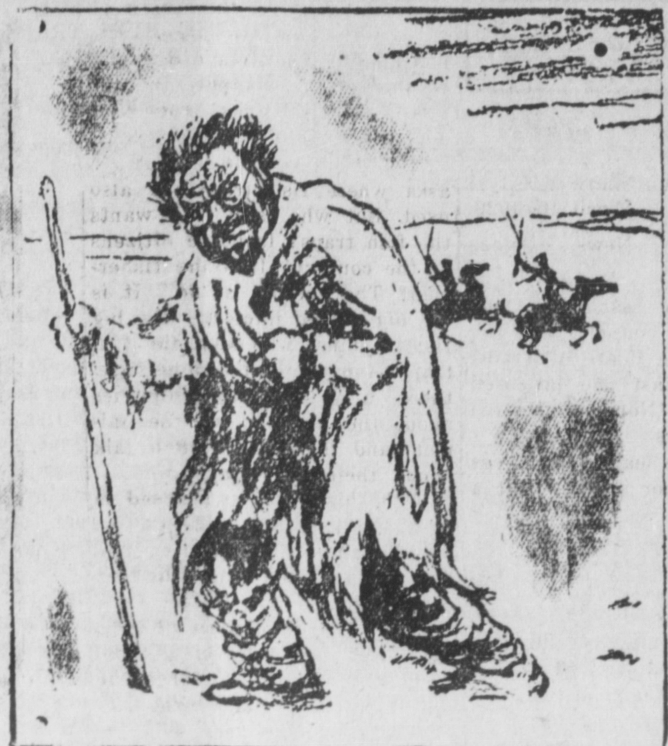
TROTSKY THE OUTCAST

Made in Canada by the makers of the famous Dominion Battleship Linoleum