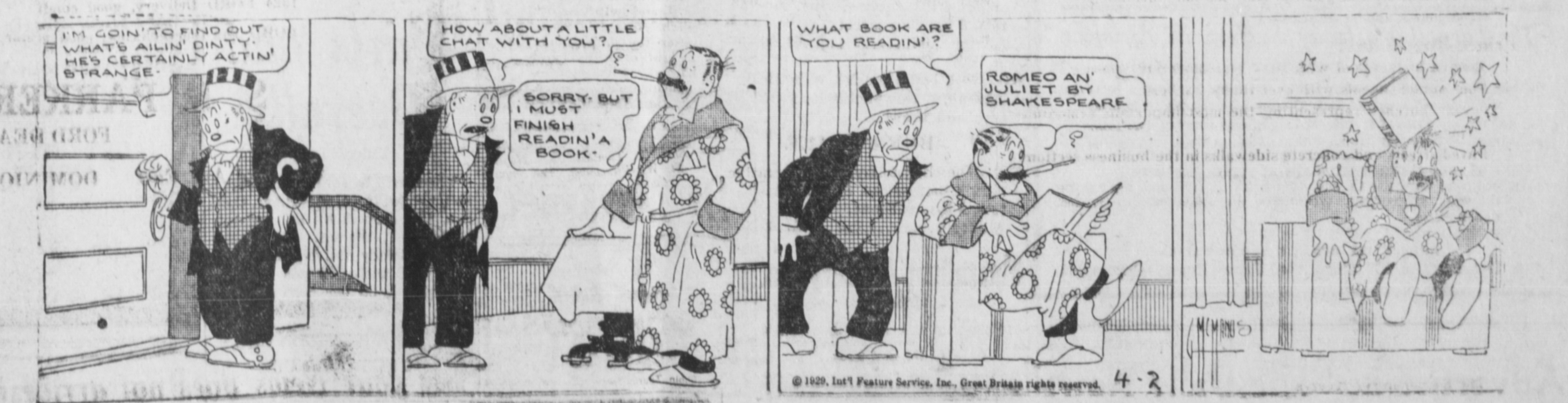
© 1929, Int'l Feature Service, Inc. Great Britain rights reserved. 4-2