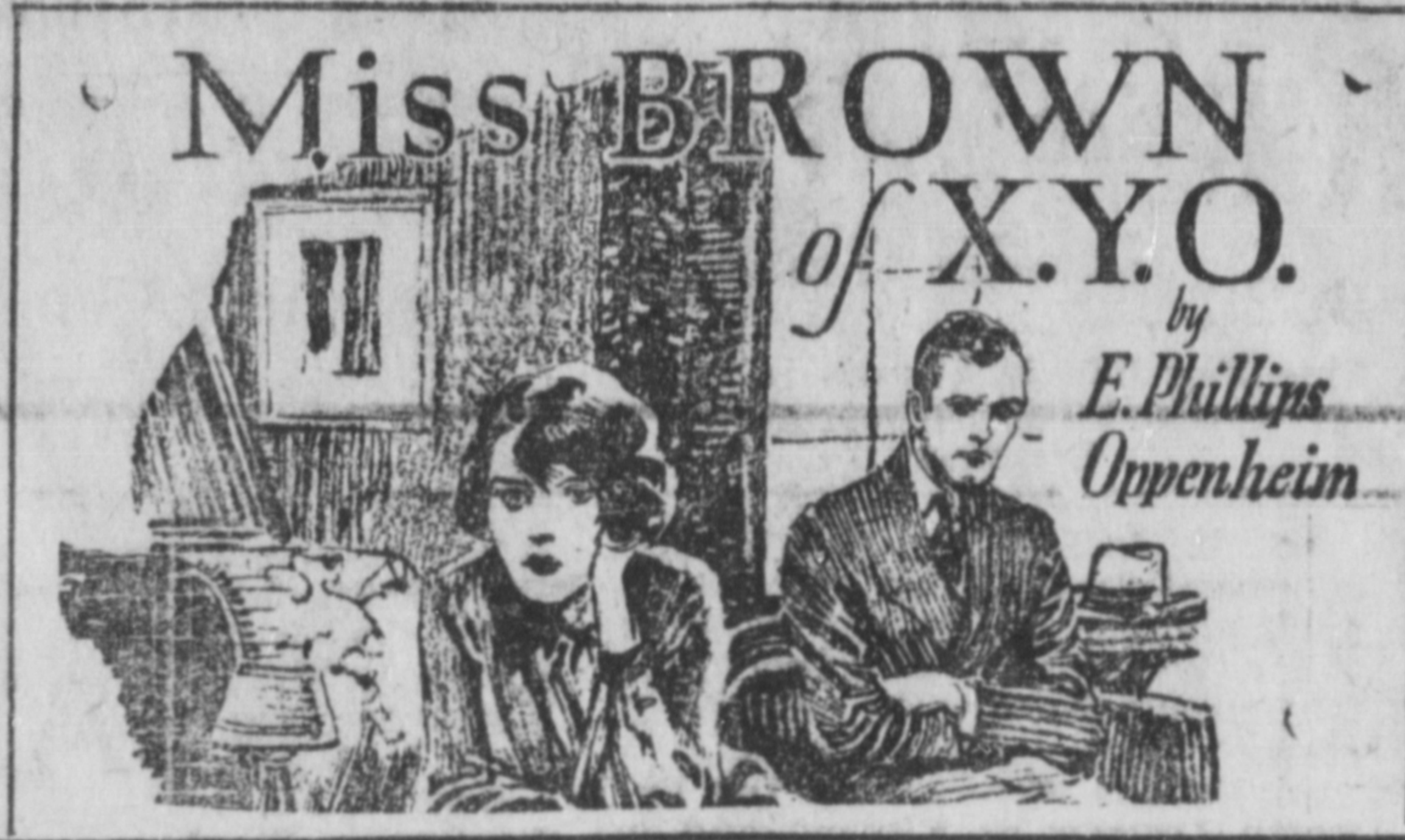
Copyright, 1927, by E. Phillips Oppenheim