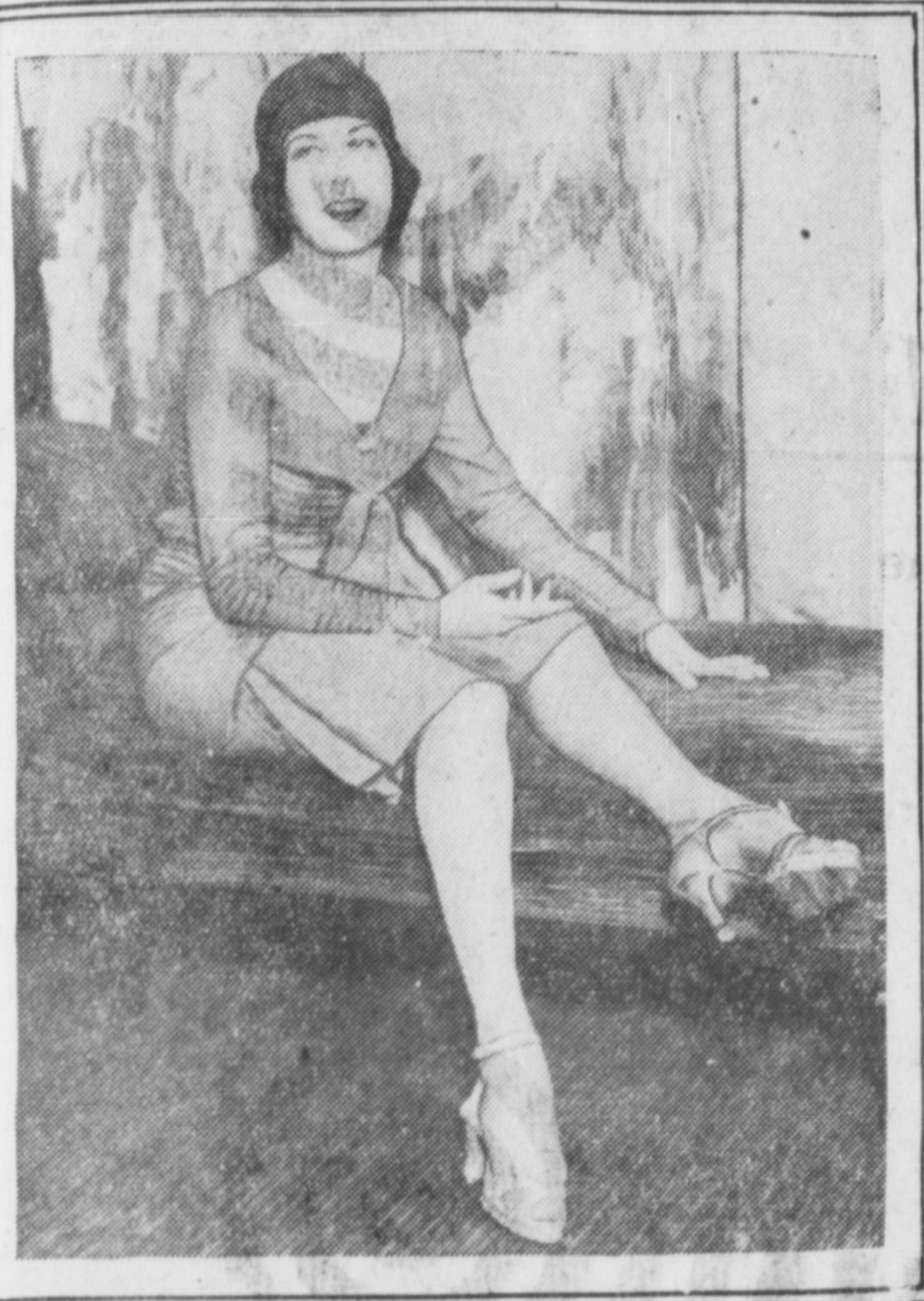
The latest French bootery being introduced in New York for afternoon and evening wear has decorative, modernistic, wooden sole.