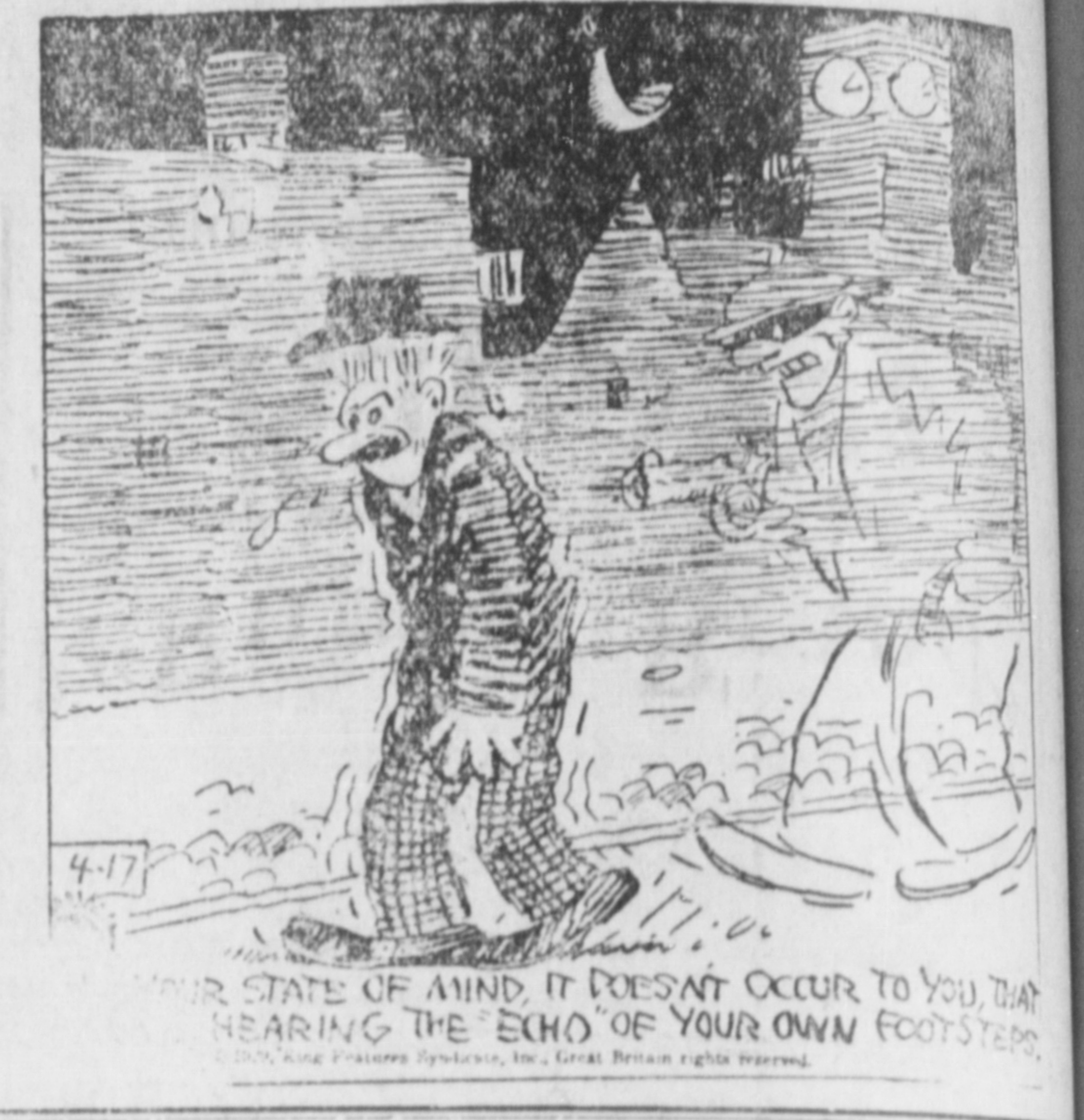
YOUR STATE OF MIND, IT DOESN'T OCCUR TO YOU, THAT HEARING THE ECHO OF YOUR OWN FOOTSTEPS.