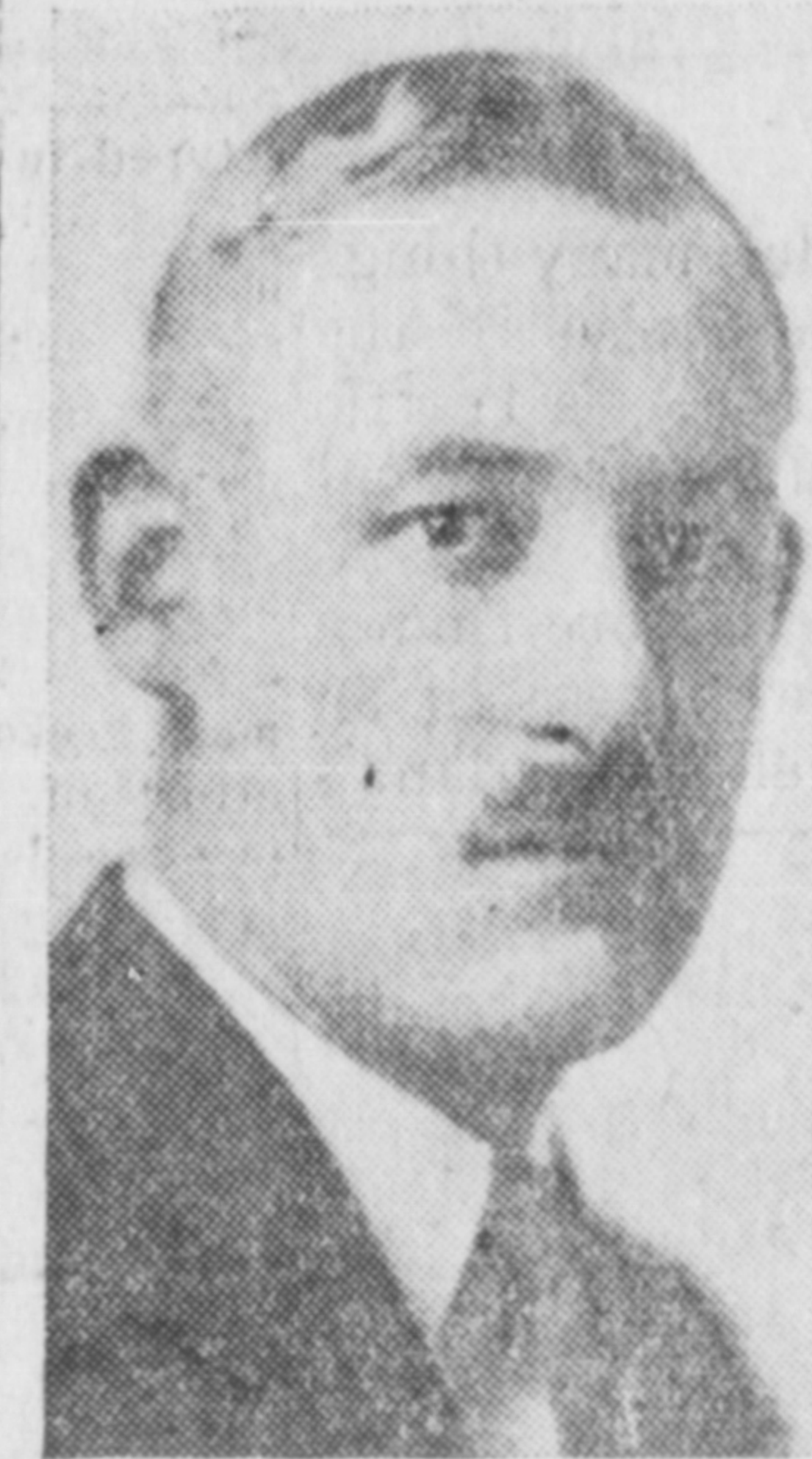
Head of the office staff of Home Oil Distributors Ltd.