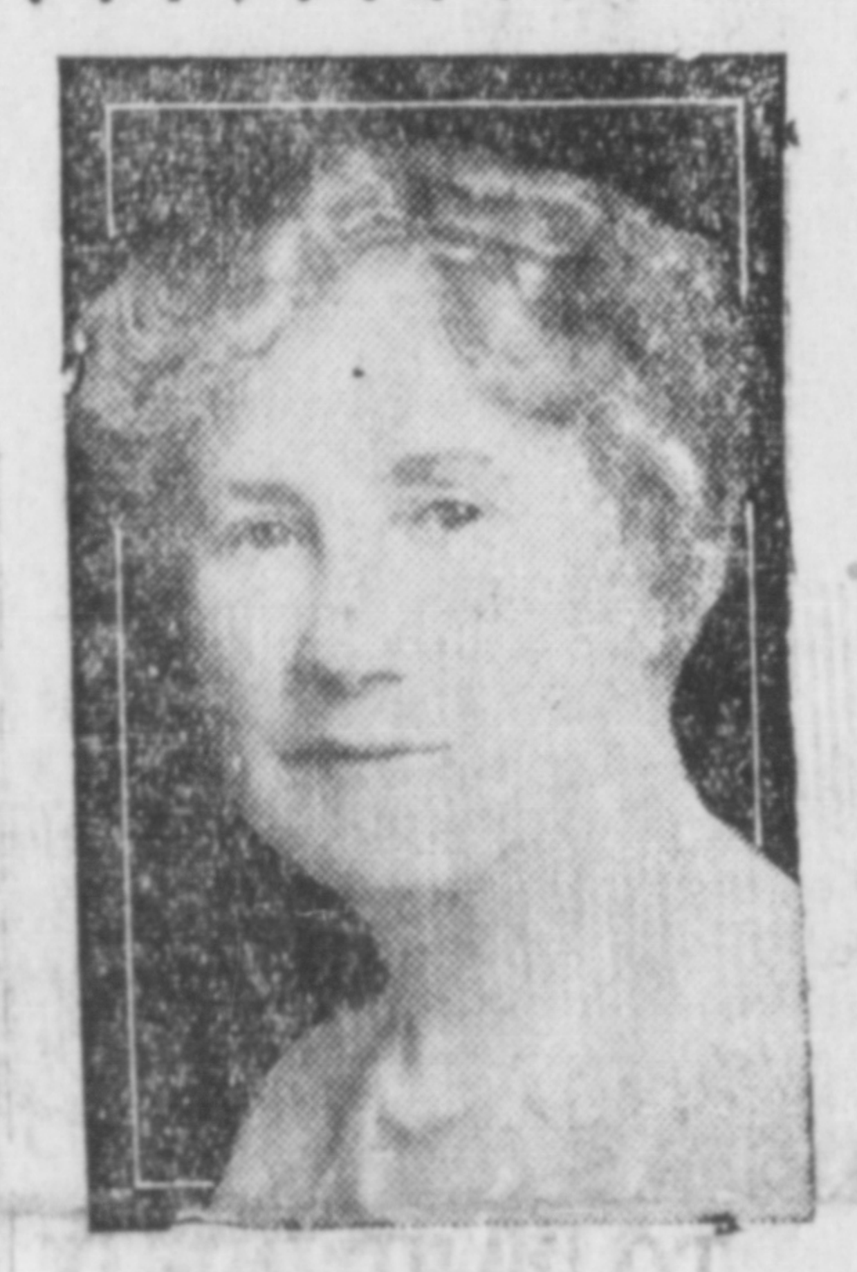
Wife of Hon. W. R. Motherwell, Minister of Agriculture, one of the principal speakers before the Ontario Women's Liberal Association at London.