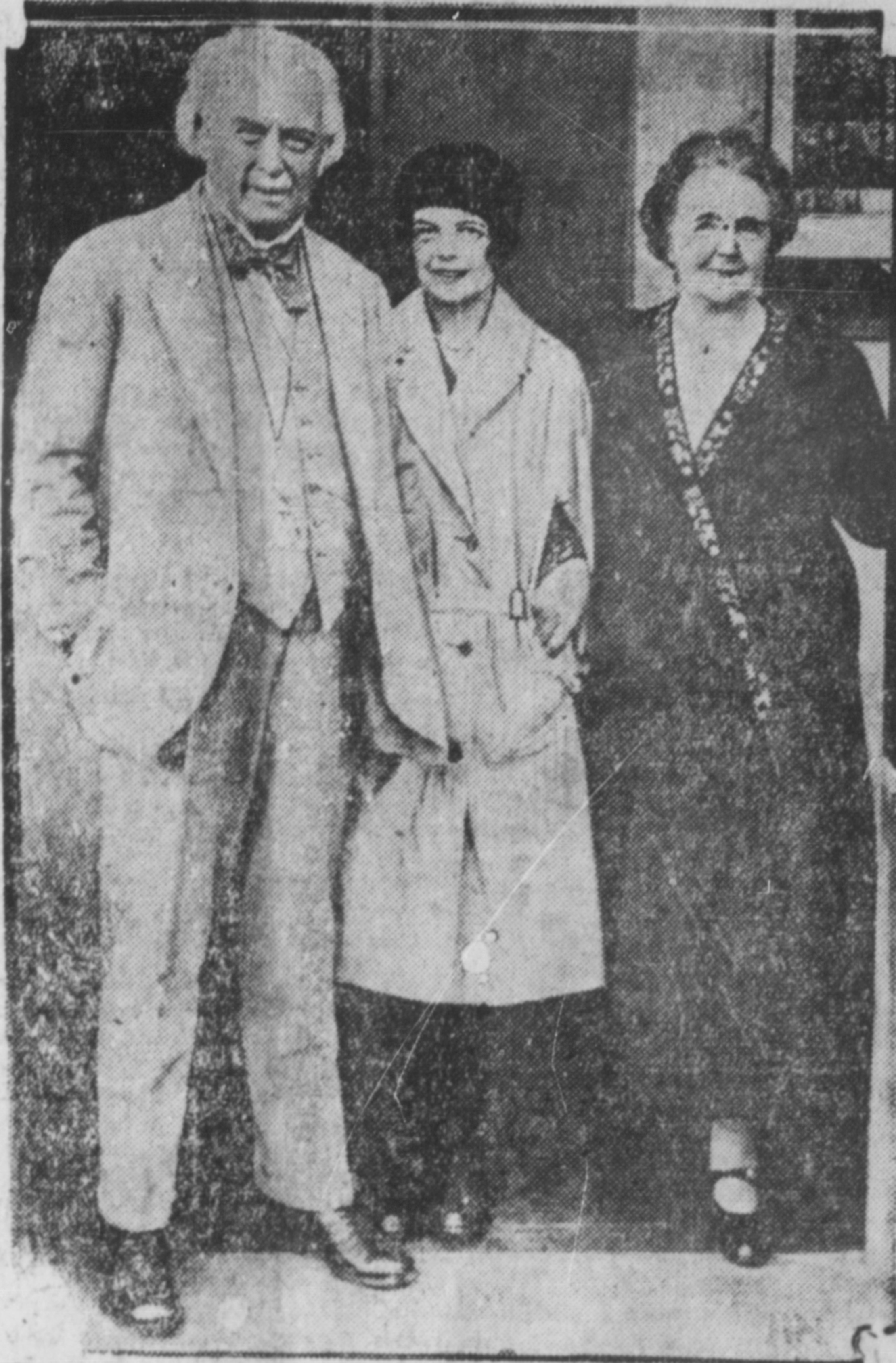
David Lloyd George, famous Liberal leader, with his charming daughter, Megan, and his wife, who allowed themselves to be photographed at their residence in London during a lull in the campaign just before the general elections. As a result of the elections Miss Lloyd George was elected to a seat in the House of Commons and her father will wield the balance of power in Parliament.