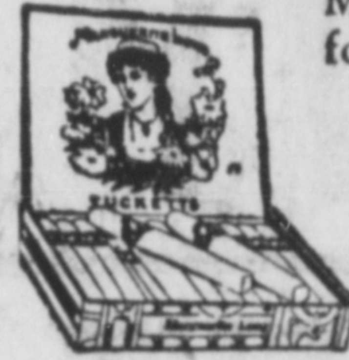
Chaper in boxes of 25 and 50. Also sold in handy pocket packs of 5 cigars.