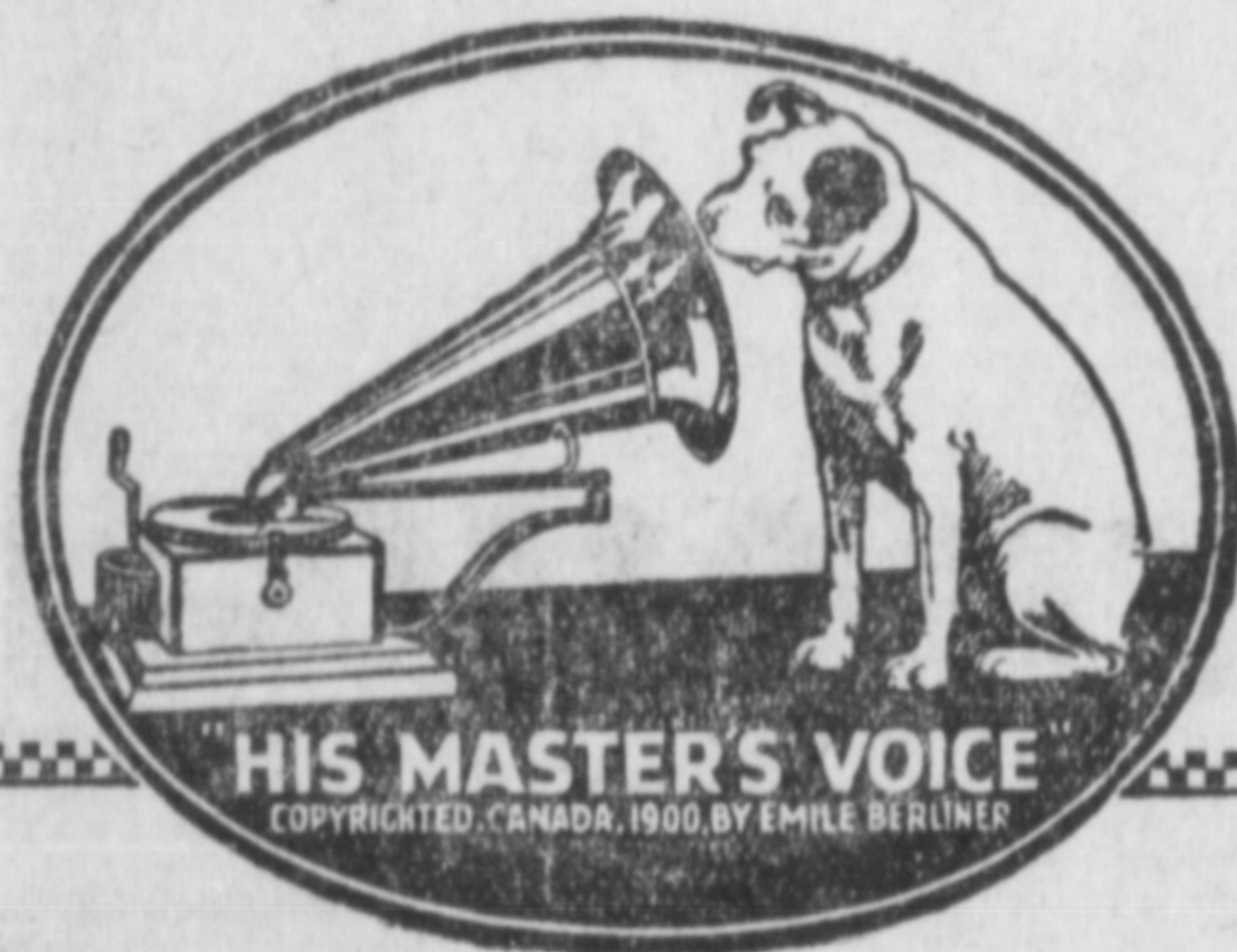
HIS MASTER'S VOICE

R-1 VICTOR TALKING MACHINE COMPANY OF CANADA LIMITED, MONTREAL