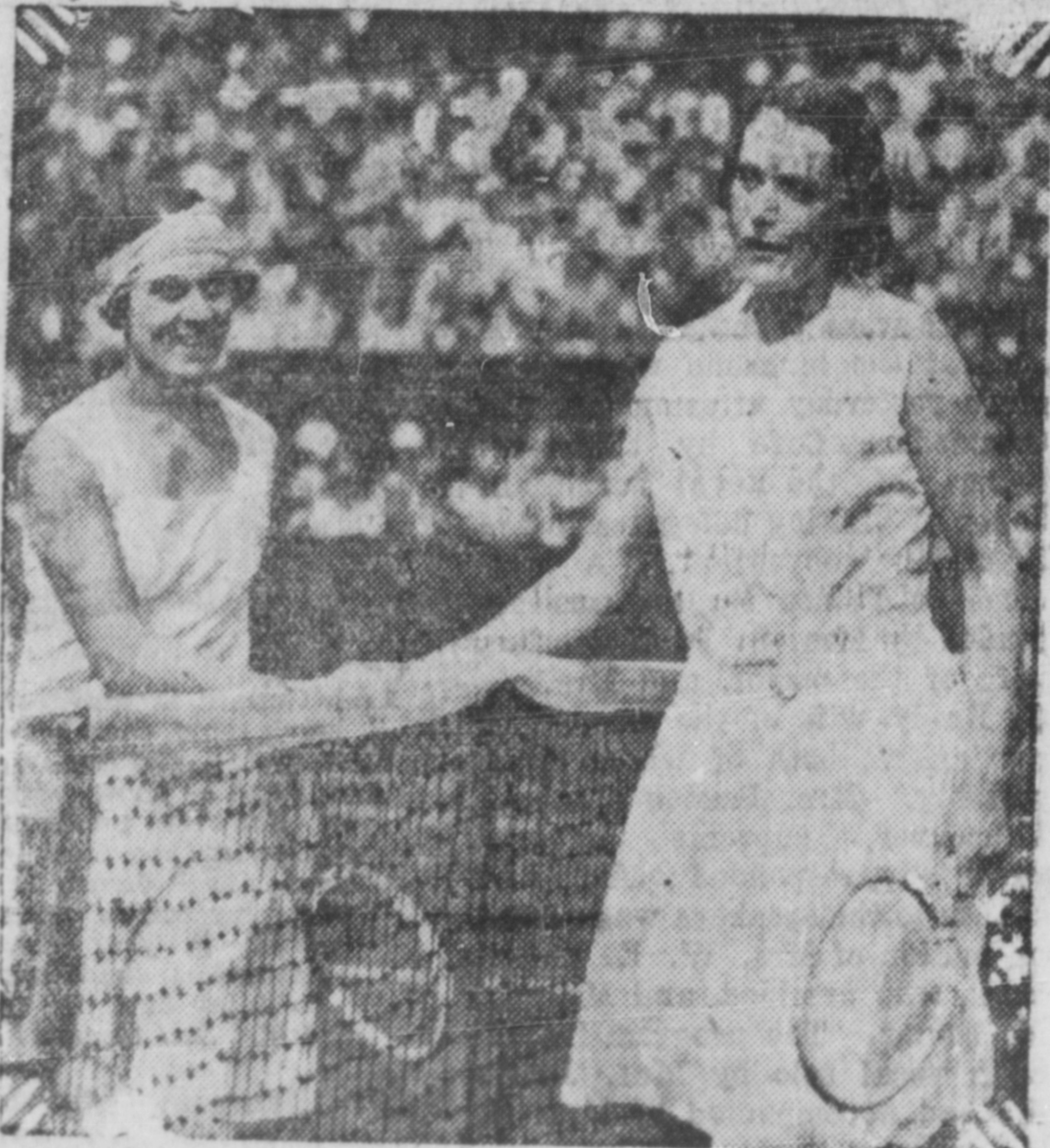
ONE OF BRITAIN'S SENSATIONAL TENNIS FINDS