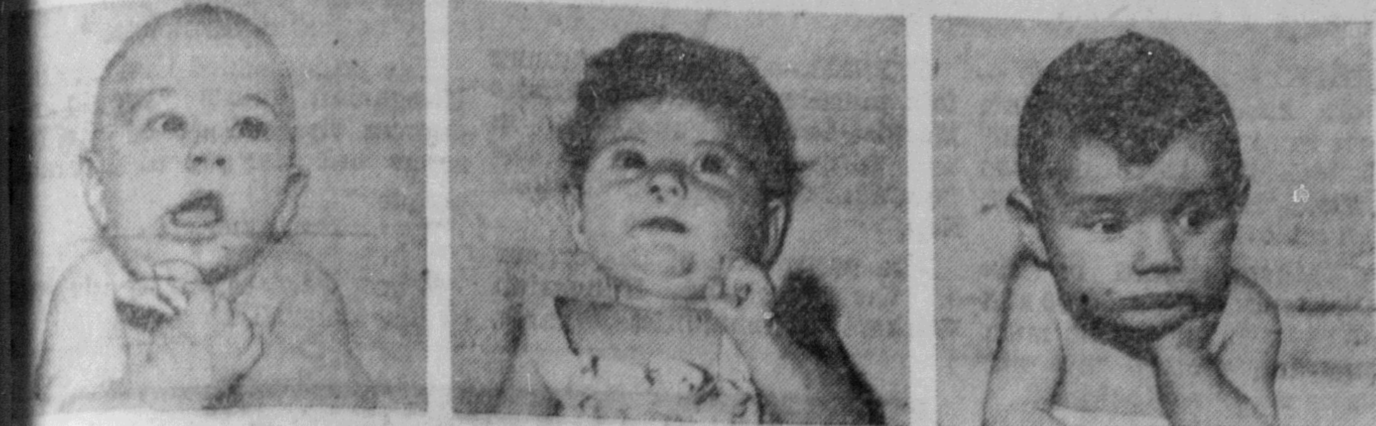
Take it easy lady... I've a wife and five kids to support." "Now lemme see... I put my right... no my left foot on the clutcher." "Oh brother... I'll sprout wings before she learns to drive."