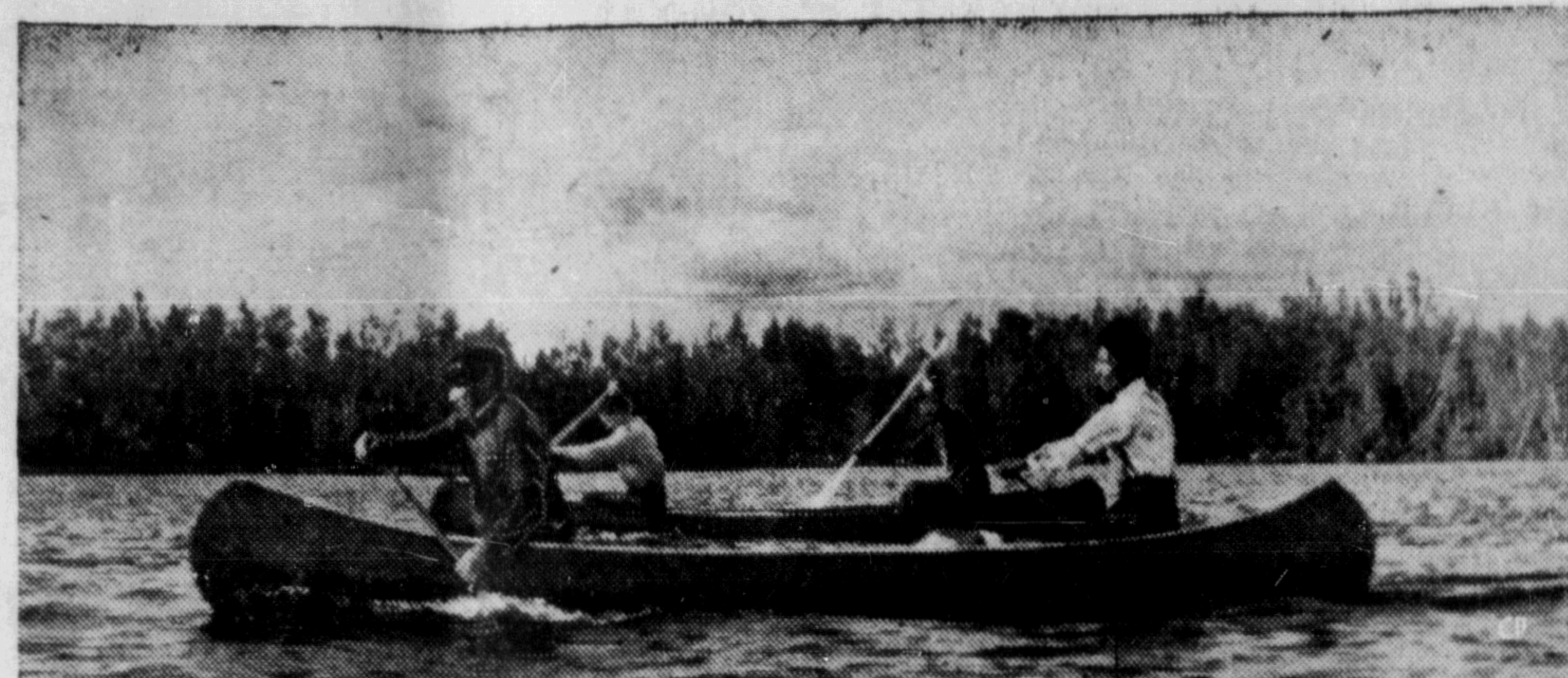
CANOE MARATHON —Two canoes battle for the lead as the 100-mile, $1,000 Gold Rush Canoe Derby got under way July 8 at Cranberry Portage, Man. The event was a feature of the first annual Northern Manitoba Trout Festival at F in Fion. Eleven teams entered the grind and first prize was $500.