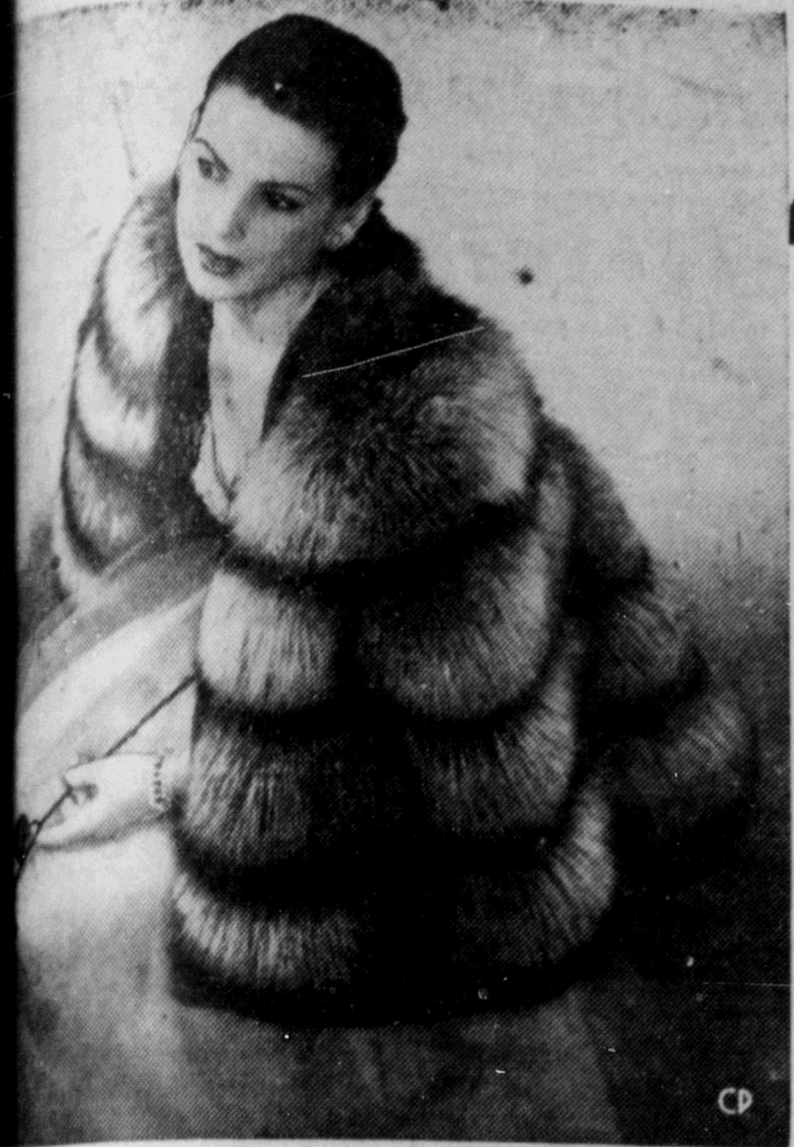
This Royal Sapphire fox cape was presented to Elizabeth at Charlottetown by Premier J. Walter Jones. It is of select grade with a very pronounced blue or color throughout. Four pelts were used in the making

The CNR magazine, in a reference to the bus service between Prince Rupert and Smithers, describes the recent change wherein the daylight schedule becomes effective. This, it is stated, is a feature which should prove popular, since many requests were made by the communities served for such a revision. The bus now leaves Prince Rupert at 8 a.m. Sundays and Fridays, arriving in Smithers at 6:40 p.m. Departure from Smithers is 8 a.m. Mondays and Saturdays, arriving in Prince Rupert at 6:40 p.m.