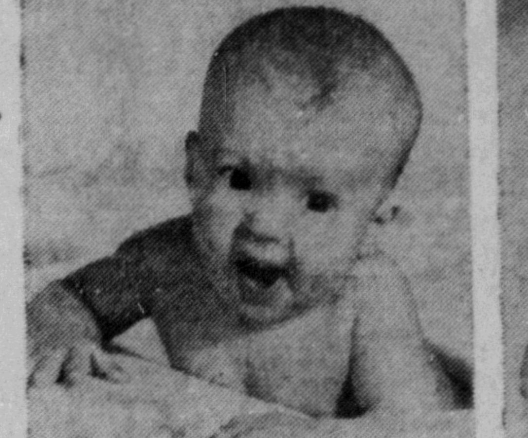
"O.K. Smiling Jack... where's your pilot's license?"