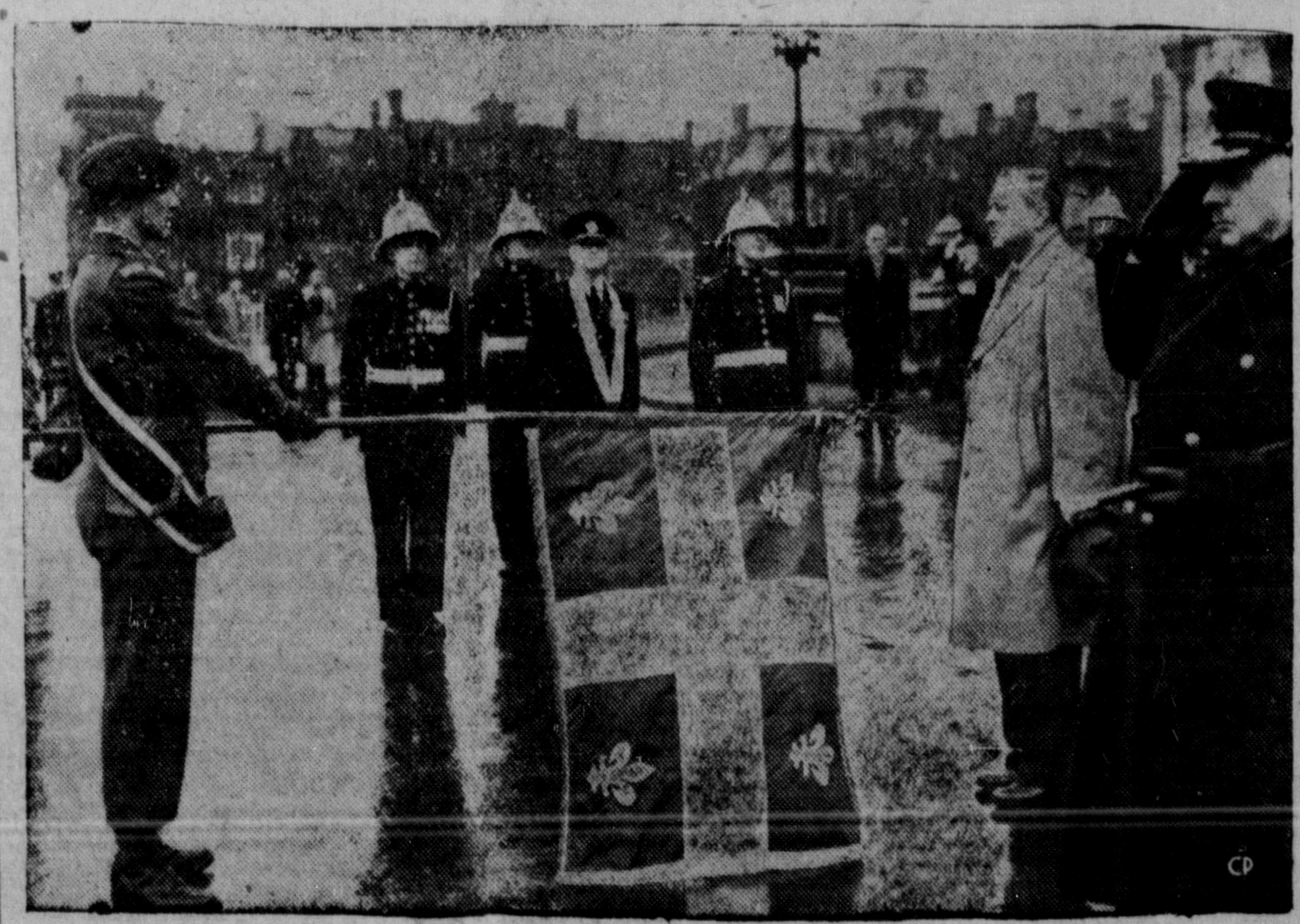
FLEUR DE LIS FOR KOREA —Quebec's official flag — the fleur-de-lis — will be carried into battle in Korea by the 2nd Battalion, Royal 22nd Regiment, now at Fort Lewis, Wash. The flag was presented to the regiment by Brig. Paul Sauve, provincial minister of youth and social welfare. Brig. Sauve is shown in civilian clothes at right during the ceremony in front of the Quebec legislature building.

CAMBRIDGE, Mass.—The touring British Cambridge University team made a clean sweep of the Patroit's Day regatta in their first intercollegiate crew competition on this side of the Atlantic.