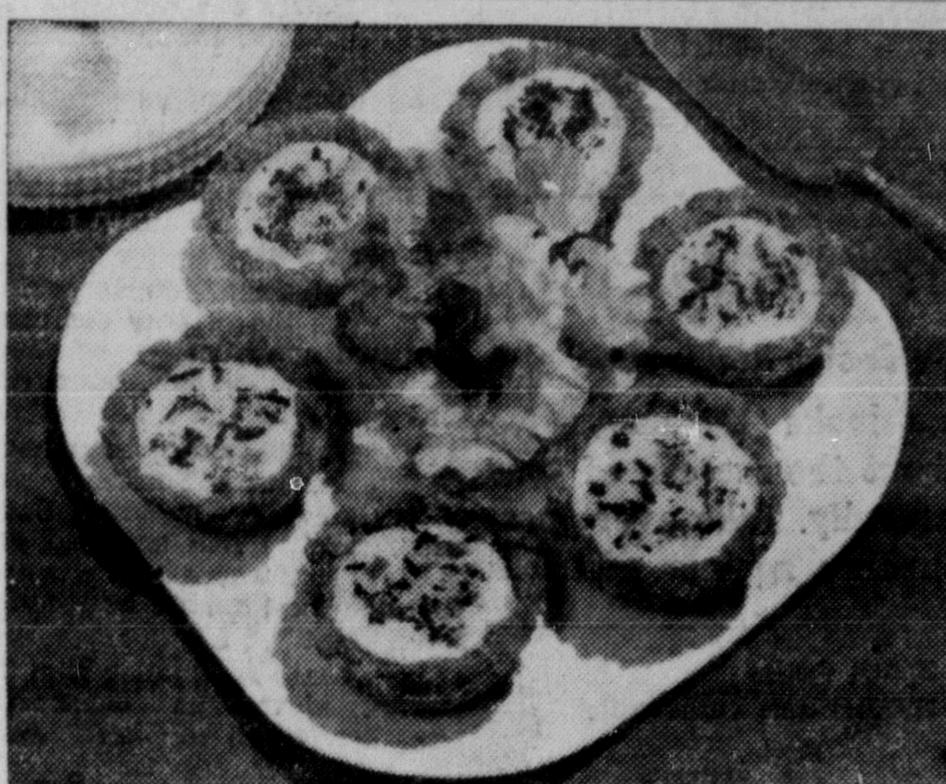
DESSERT PATTY SHELLS

Dated this 11th day of August, A.D. 1951. BELRUPER HOTEL LIMITED. (211)