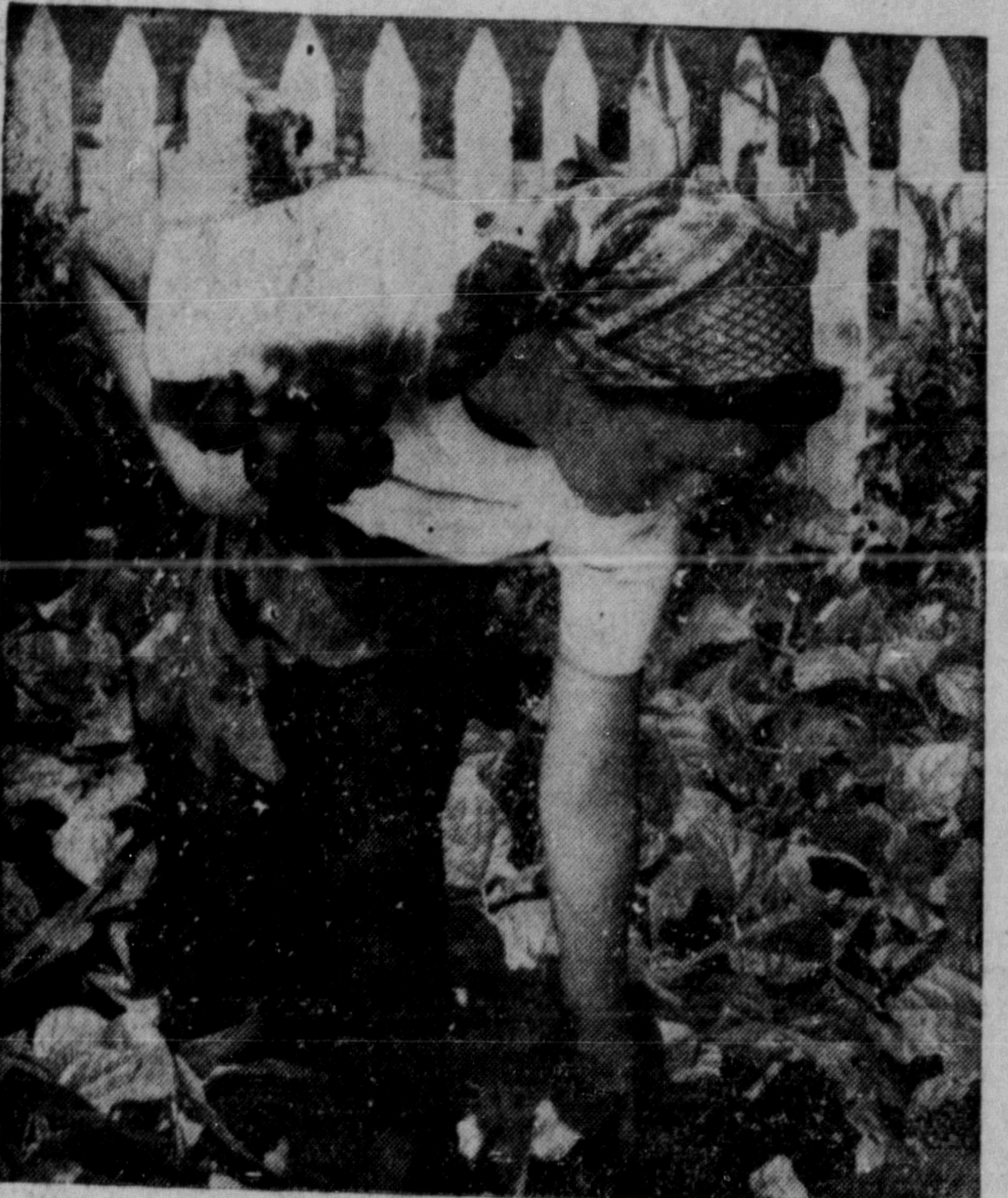
Beets Are Best for the Table and for Canning When as Large as Golf Balls

Beets give a heavy yield for the space they take in the home garden; and can be harvested all summer long and served in many delicious ways. The height of their quality is reached when they are as big as a golf ball; so several sowings at intervals are advisable to keep new crops coming to be harvested in their prime.