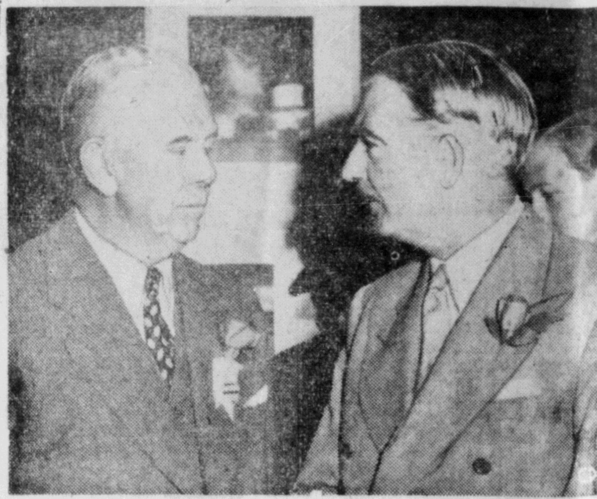
EXHIBITION VISITORS—Defence Secretary George C. Marshall of the U.S., left, chats with Anthony Eden, former British foreign minister, after the official opening of the Canadian National Exhibition in Toronto. Gen. Marshall was the first American to officially open the "Ex."