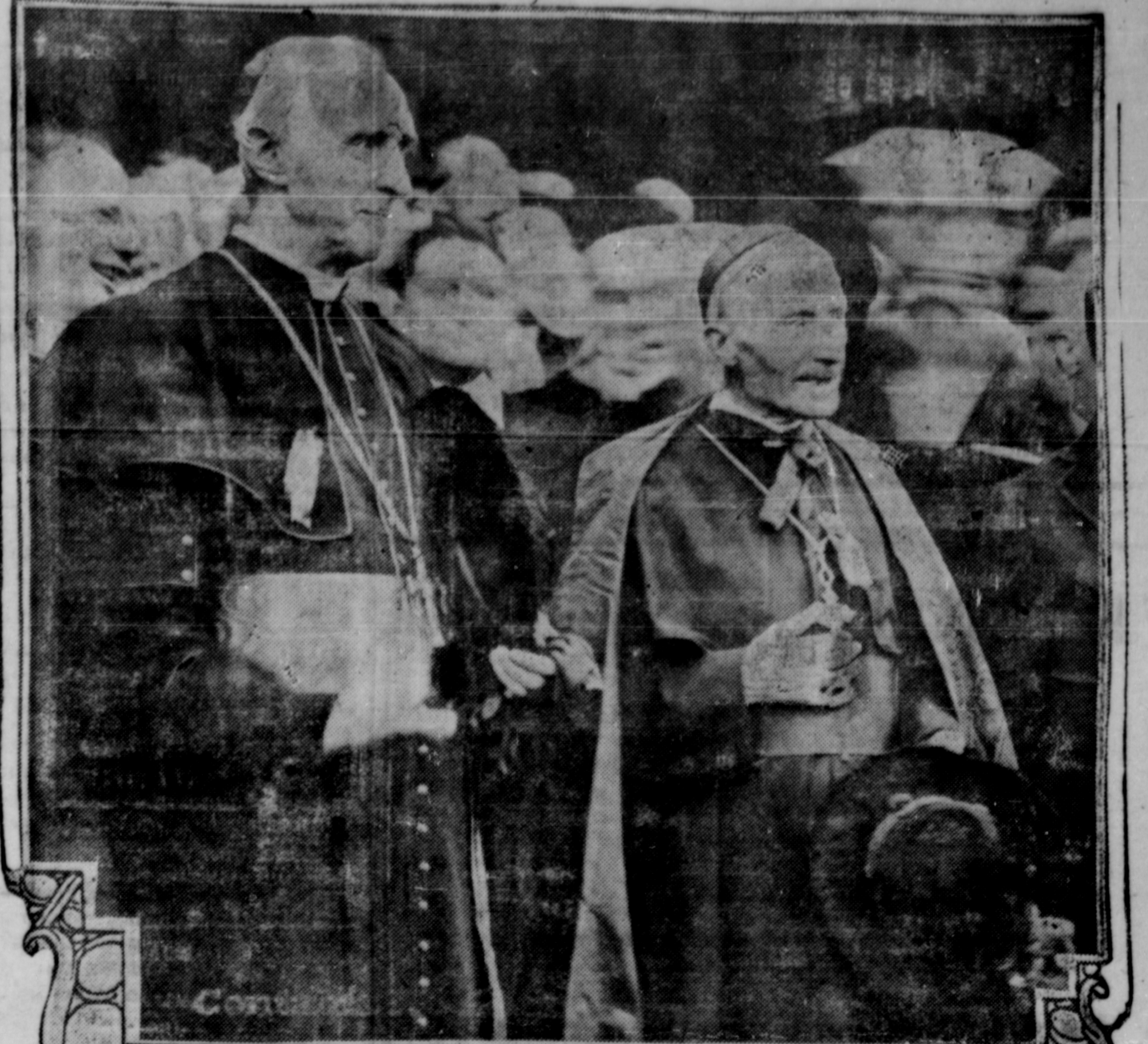
CARDINAL MERCIER, UPON HIS ARRIVAL IN BALTIMORE, and CARDINAL GIBBONS.

Declaring in writing that victory in the great war was due to the American army and lauding General Pershing as a "genial leader." Desideratus Cardinal Mercier, hero priest of Belgium, left New York for Baltimore, Md., after reviewing for half an hour the historic parade of the First Division. On arriving in Baltimore the Belgian prelate was warmly greeted by Cardinal Gibbons. Before leaving for Baltimore Cardinal Mercier prepared a little statement, in which he said:—"The American army won the war. General Pershing is a genial leader; to him our respect, to him our universal gratitude."