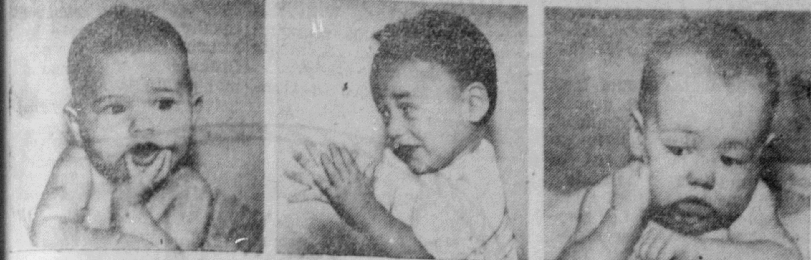
"Wonder if he can really read music?" "She can't sing very well, but she IS very pretty..." "I'll be darned if I know why I let her drag me to these things!"