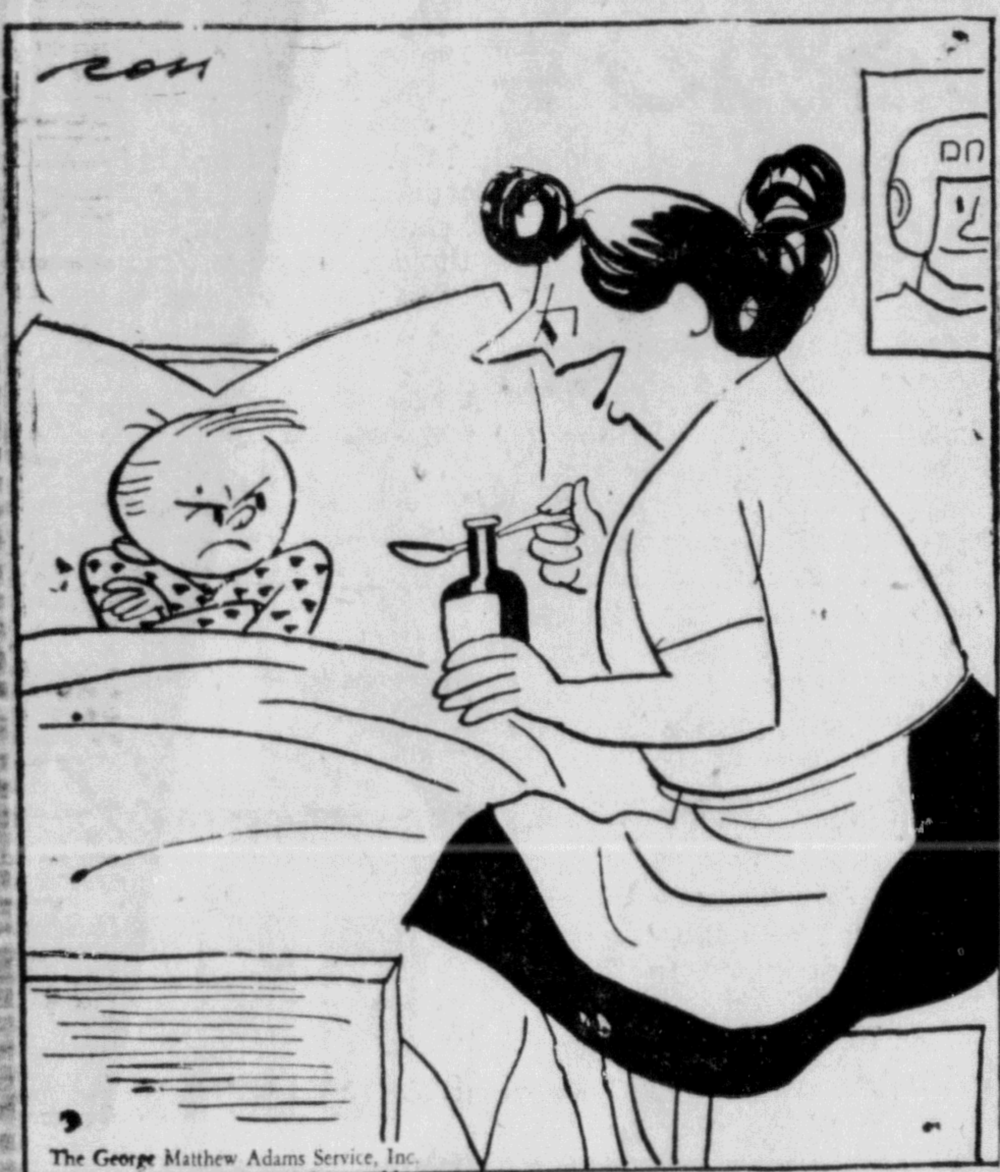
The George Mathew Adams Service, Inc. "Being too sick to go to school has certain disadvantages and castor oil is one of them!"