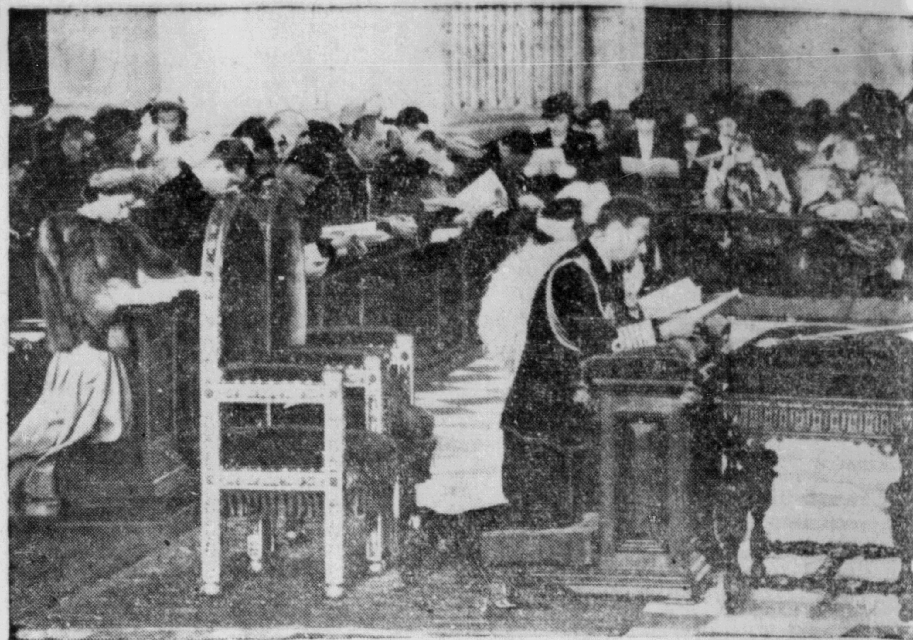
SILVER WEDDING —In 1948, Their Majesties celebrated their Silver Wedding anniversary. A special service was held at St. Paul's Cathedral to commemorate the event. This United Kingdom Information Office photo shows King George and Queen Elizabeth kneeling in prayer. Seated in the row of seats behind them are Princess Elizabeth, the Duke of Edinburgh and other members of the Royal Family.