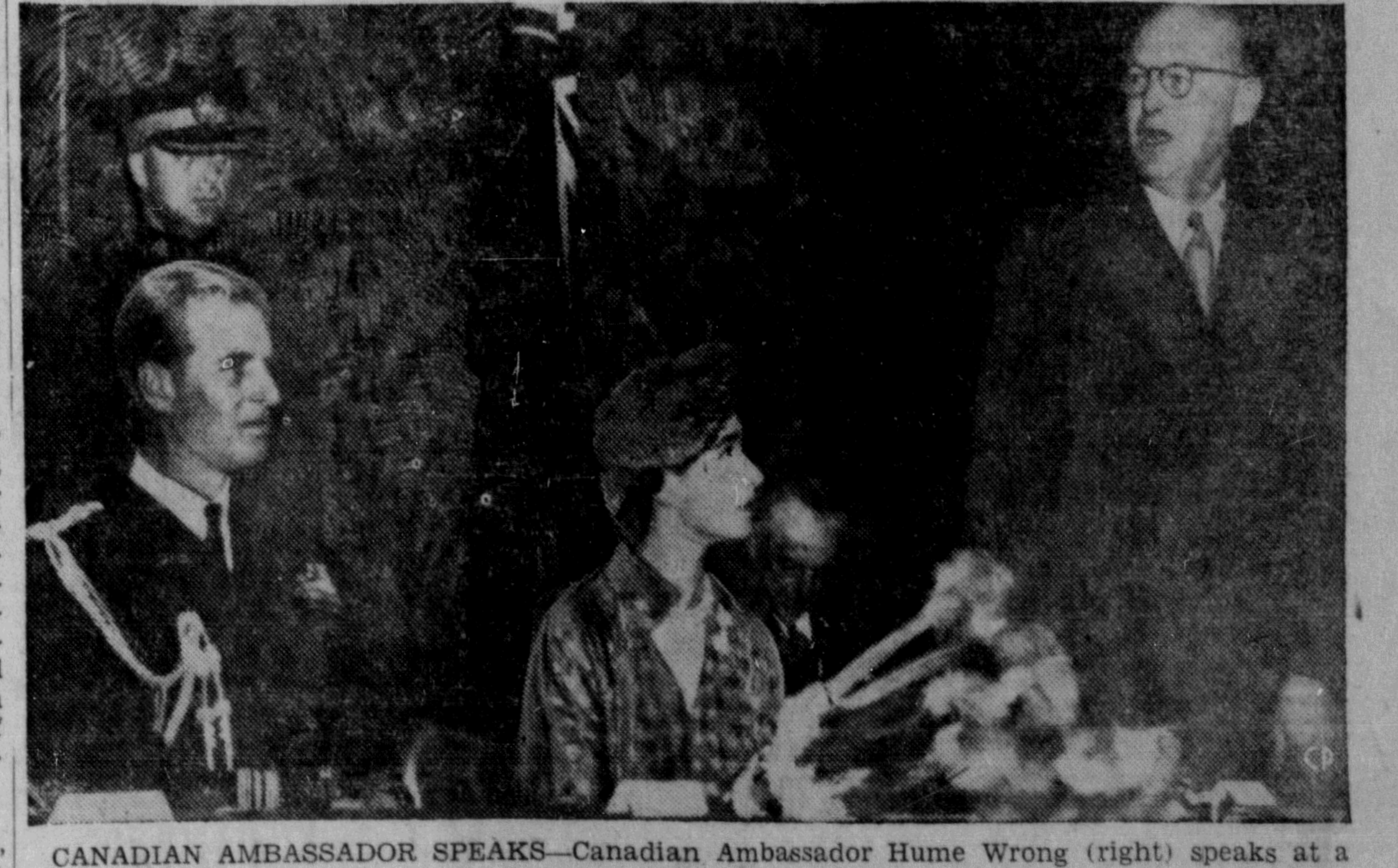
CANADIAN AMBASSADOR SPEAKS—Canadian Ambassador Hume Wrong (right) speaks at a press reception for Princess Elizabeth and the Duke of Edinburgh Wednesday night shortly after the arrival in Washington of the royal couple. The Princess charmed about 800 newspaper and radio representatives at her first experience with a full-scale United States press conference.