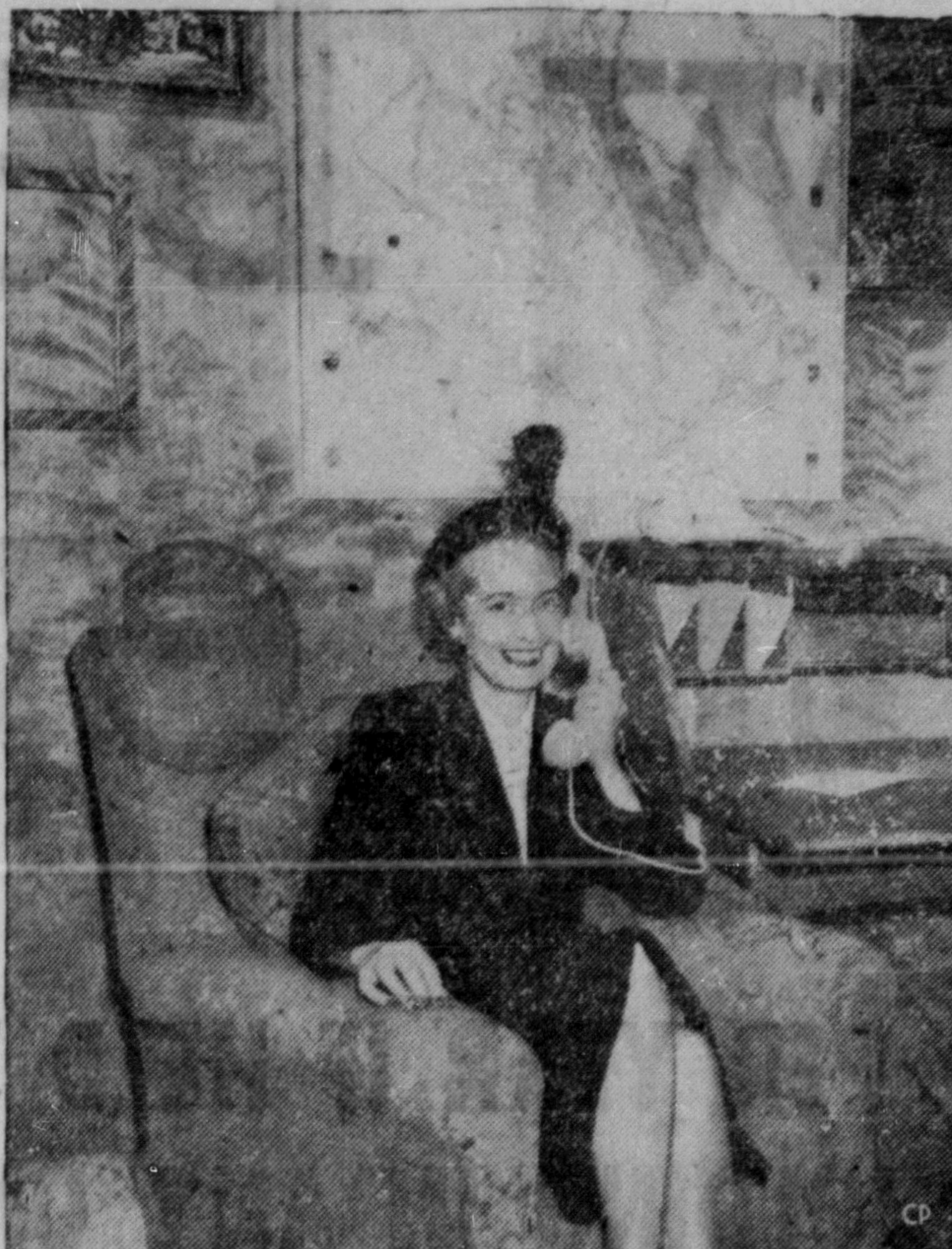
PRINCESS'S SITTING ROOM—A model uses the phone in the sitting room in the rear of the sleeping car prepared for Princess Elizabeth. A map on the wall is placed so the Princess and the Duke of Edinburgh may chart the tour's progress. This car will be at the end of the train and will be used as an observation car.