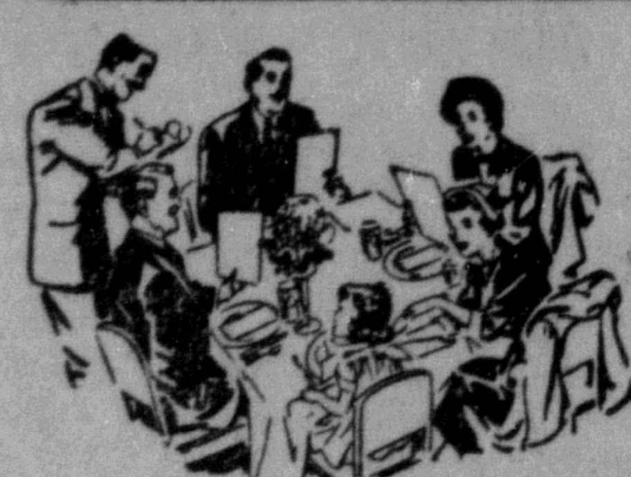
"Hospitality and Good Food" That is Our First Aim Phone 17 for Orders To Take Out

If you want to sell it, advertise it. News classifieds