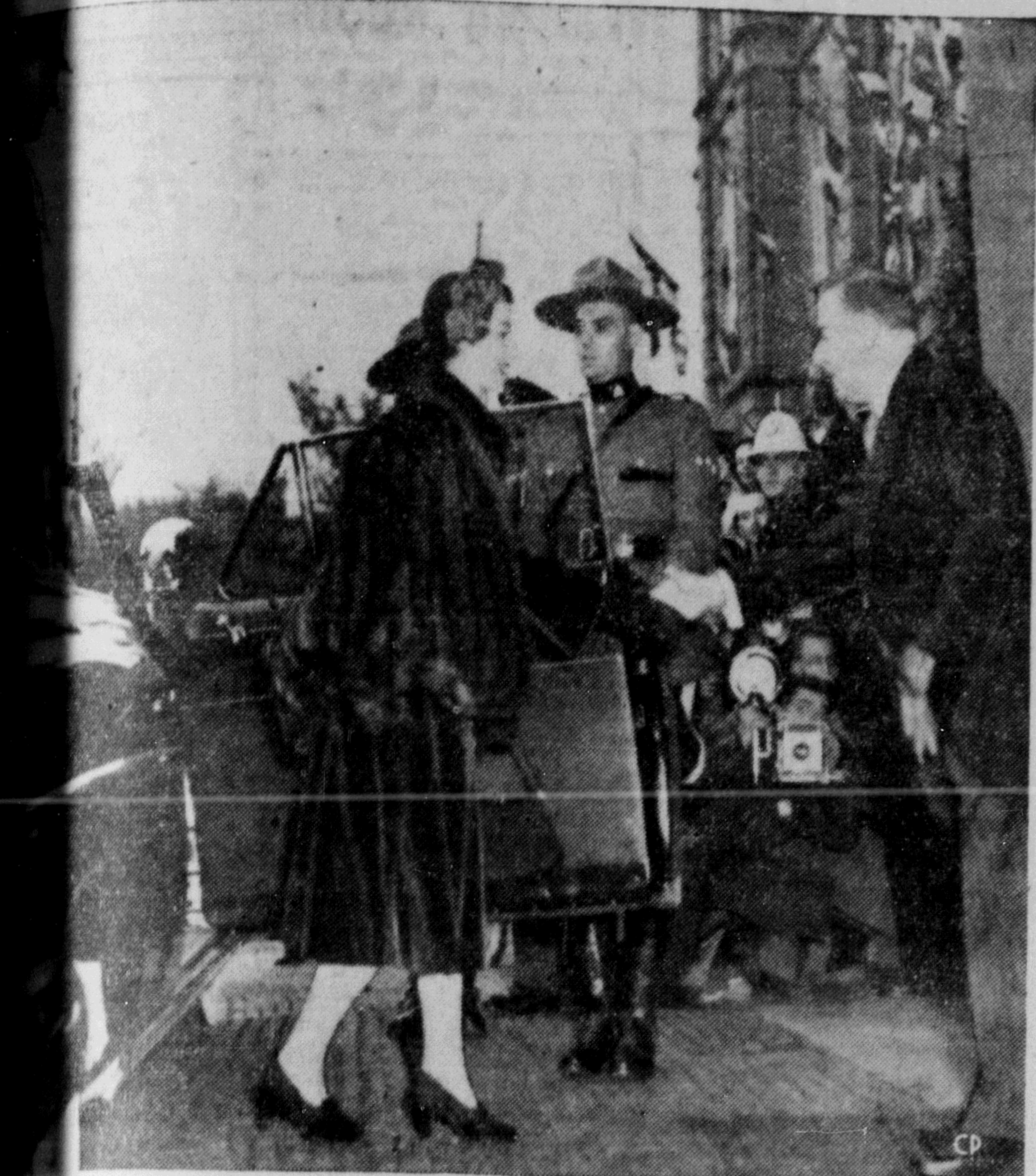
Princess Elizabeth—Premier Duplessis welcomes Princess Elizabeth on her arrival at the Legislature in Quebec City recently. The Duke of Edinburgh is still standing in the left.