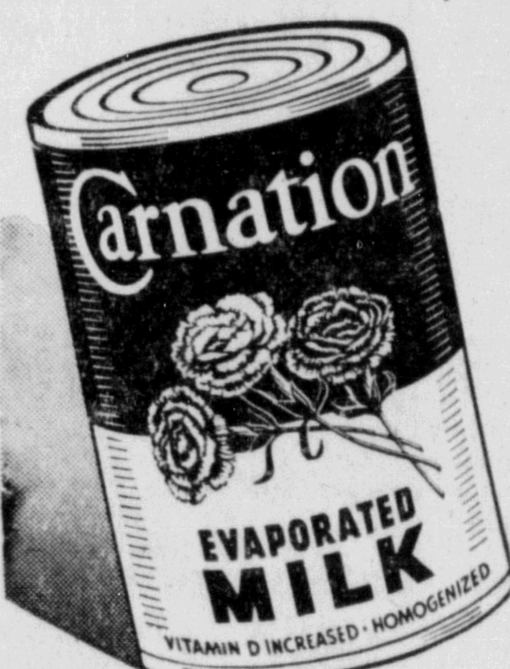
"from Contented Cows"

Whatever your experience has been with evaporated milks, you'll be delighted to find out how much more you'll like Carnation Evaporated Milk. A full half-century of experience lies behind the making of Carnation. So you're sure of finer flavor and consistency... longer keeping qualities... when you use the milk with the red and white Carnation label.