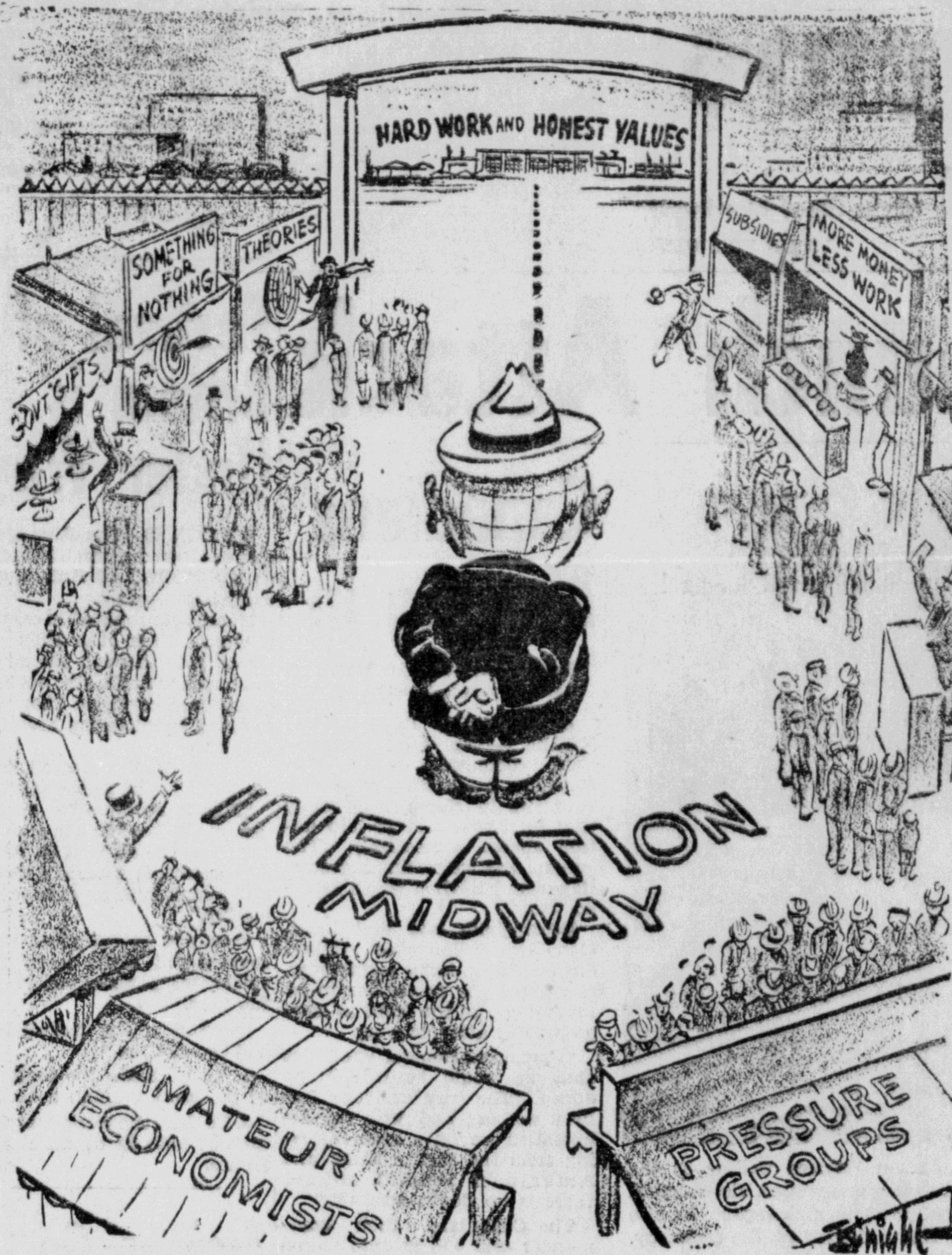
THE OUTSIDE LOOKS BETTER EVERY DAY—By Charlie Knight in the Windsor (Ont.) Star.