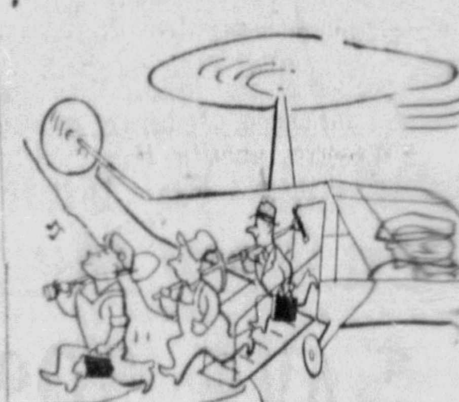
Flying freight elevator

For instance, the laws of Moses which now seem to us of such extreme severity had to be severe to strike at the conditions which kept human beings on a moral plane hardly above that of animals. Humans not only had sex relations on a basis of what our law calls incest—