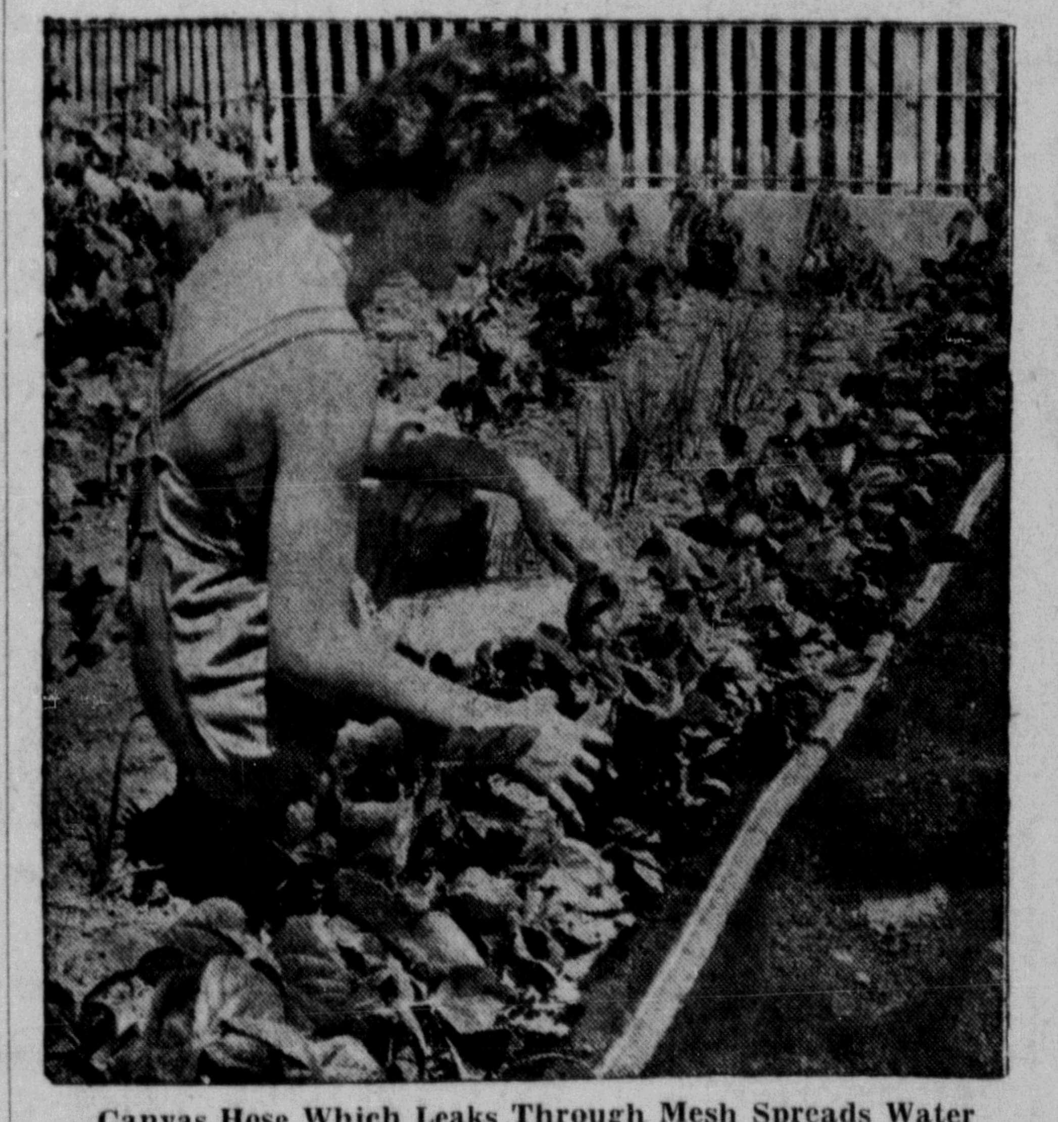
Canvas Hose Which Leaks Through Mesh Spreads Water Evenly Over Garden

Gardening.... GIVE YOUR GARDEN A DRINK WHEN TOP SOIL DRIES OUT