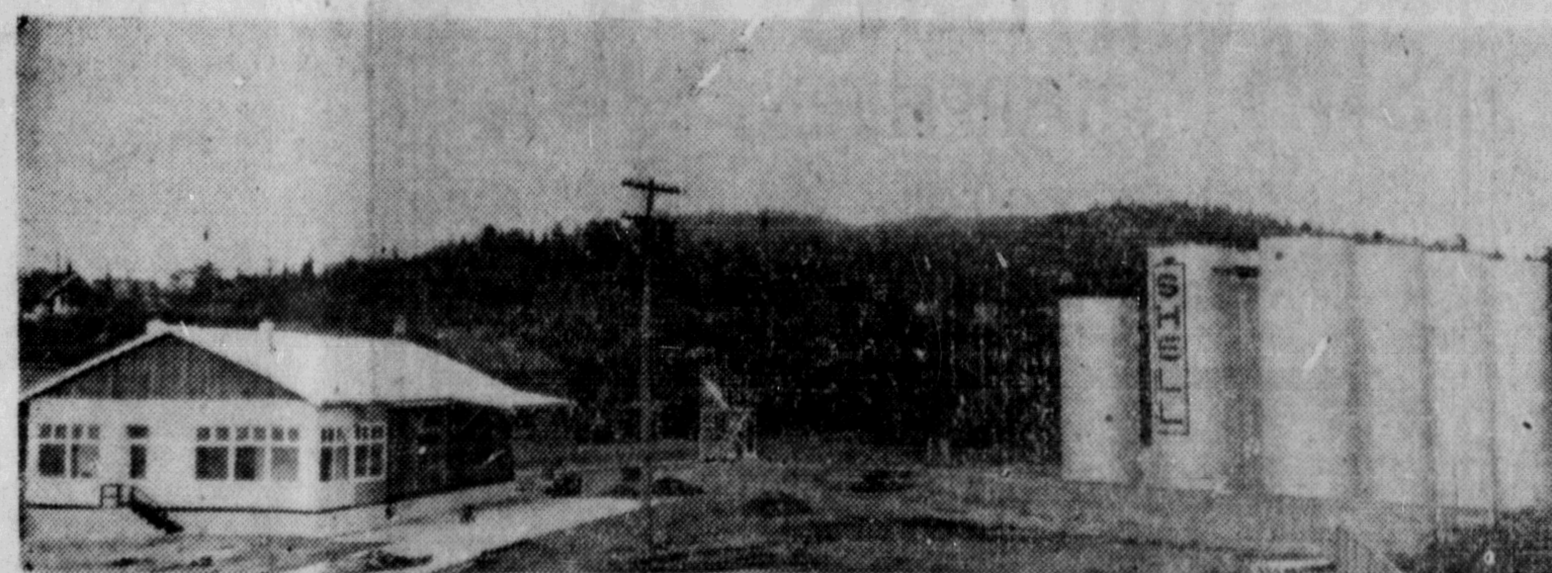
SHELL'S new Prince Rupert Terminal is the distribution centre for the neighbouring coastal and island area. Located on the waterfront, adjacent to the Grain Commissioner's dock, railway tank car loading facilities have been installed to handle large bulk shipments of petroleum products.

Rupert terminal and distribution centre is equipped for railroad and water shipments. Shell has been serving industry in British Columbia for over 36 years with refining and manufacturing facilities.