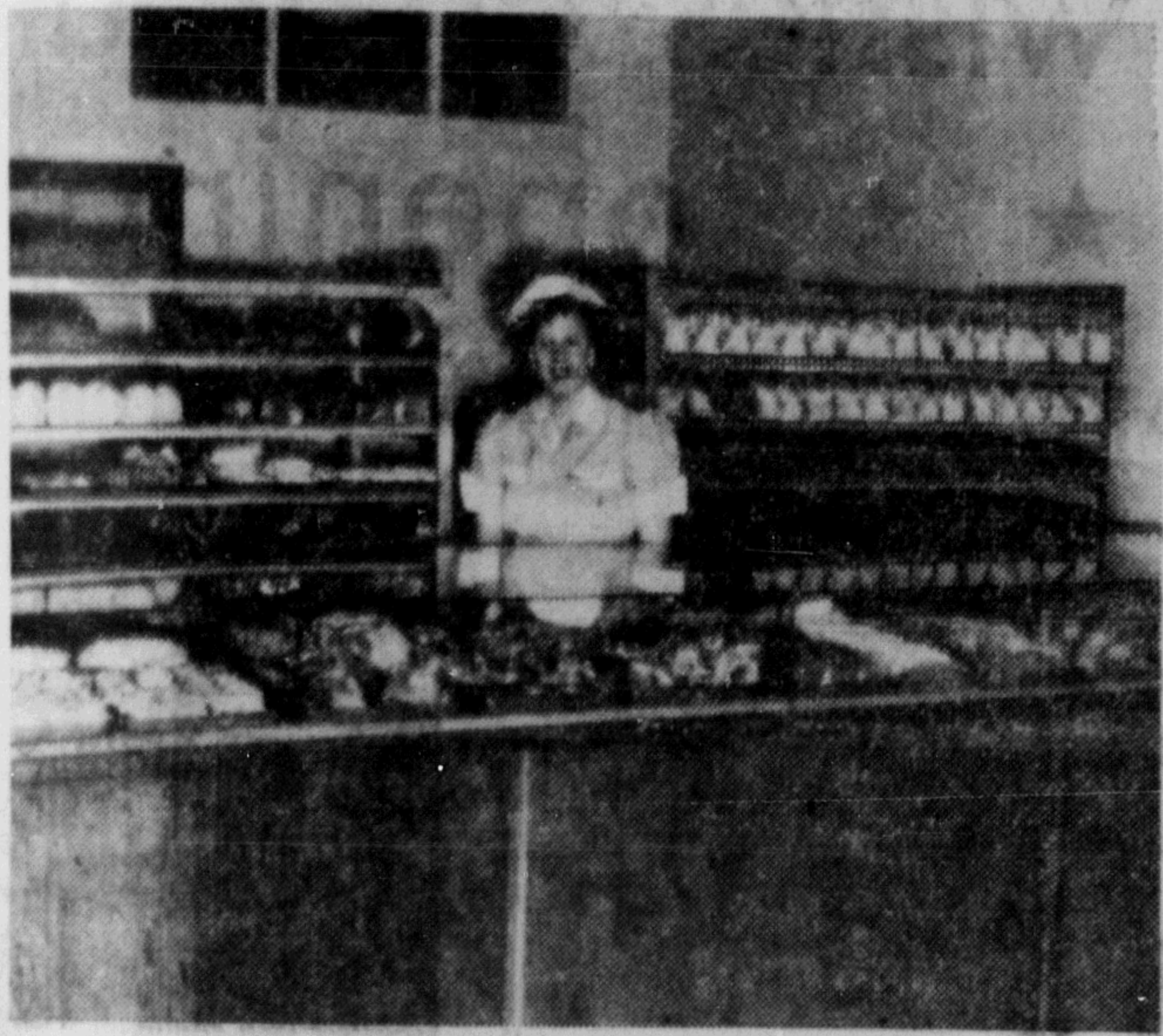
BAKERY, FULLY MODERN and up-to-date in every way was established to serve the needs of fishermen at sea. Today it is one of Prince Rupert's leading bakeries of delicious bread and cakes.

Fishermen Have Found "It Pays to Co-Operate"