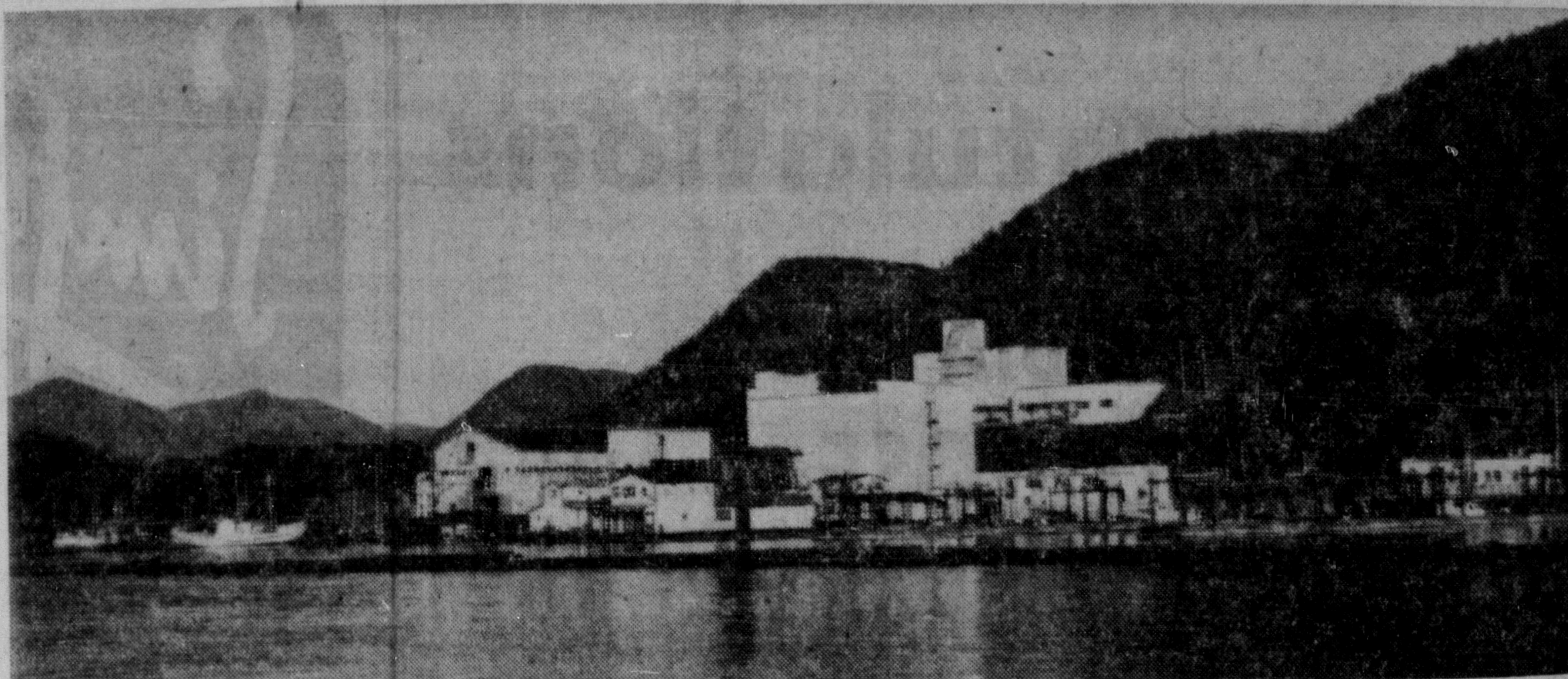
IN PICTURESQUE SETTING of Prince Rupert's waterfront stands the million-dollar plant of Prince Rupert Fishermen's Co-operative Association, started by a modest fresh-liver reduction unit. Today it handles a major portion of the North's fresh and frozen fish production.