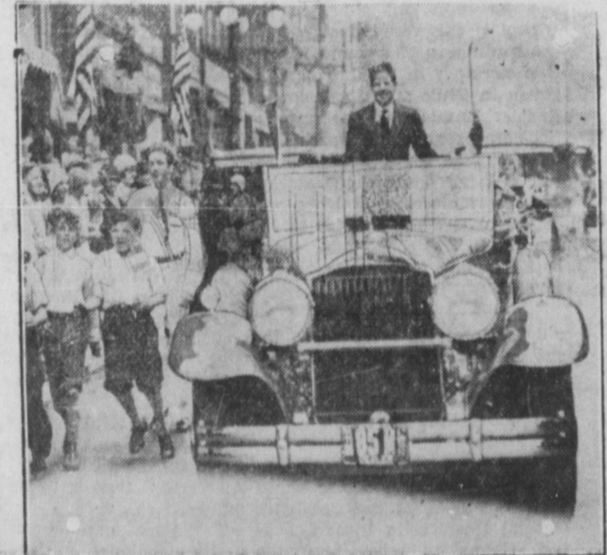
Rudy Vallée, noted crooner of the air, leading automobile parade staged in his honor in Portland, Me., while en route for Westport, his home town.

A Daily News want-ad will bring results.