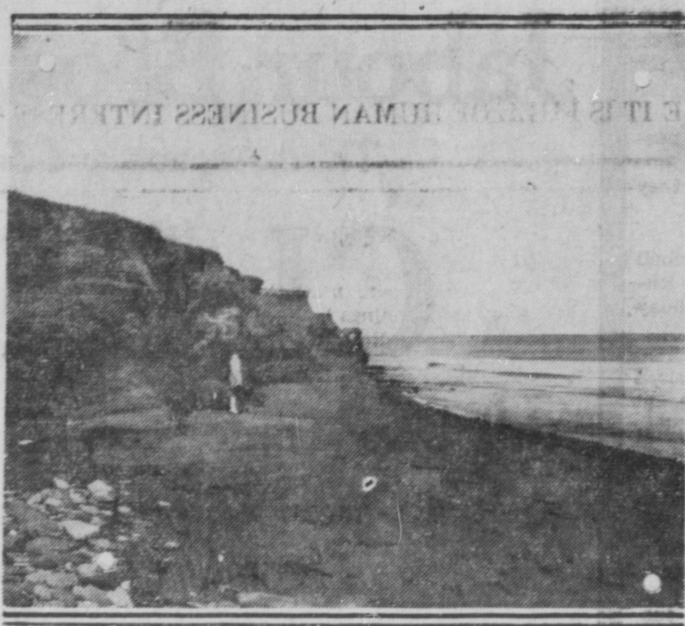
Picturesque beach scene from Kildore, Prince Edward Island, a splendid haven of beauty and pastoral surroundings for the tourist. The island, sometimes known as "The Garden of the Gulf," has about 90,000 inhabitants.

A new air-cooled machine gun, with compensating sight, has been developed for the U. S. Air Service, which fires from 600 to 800 rounds per minute.