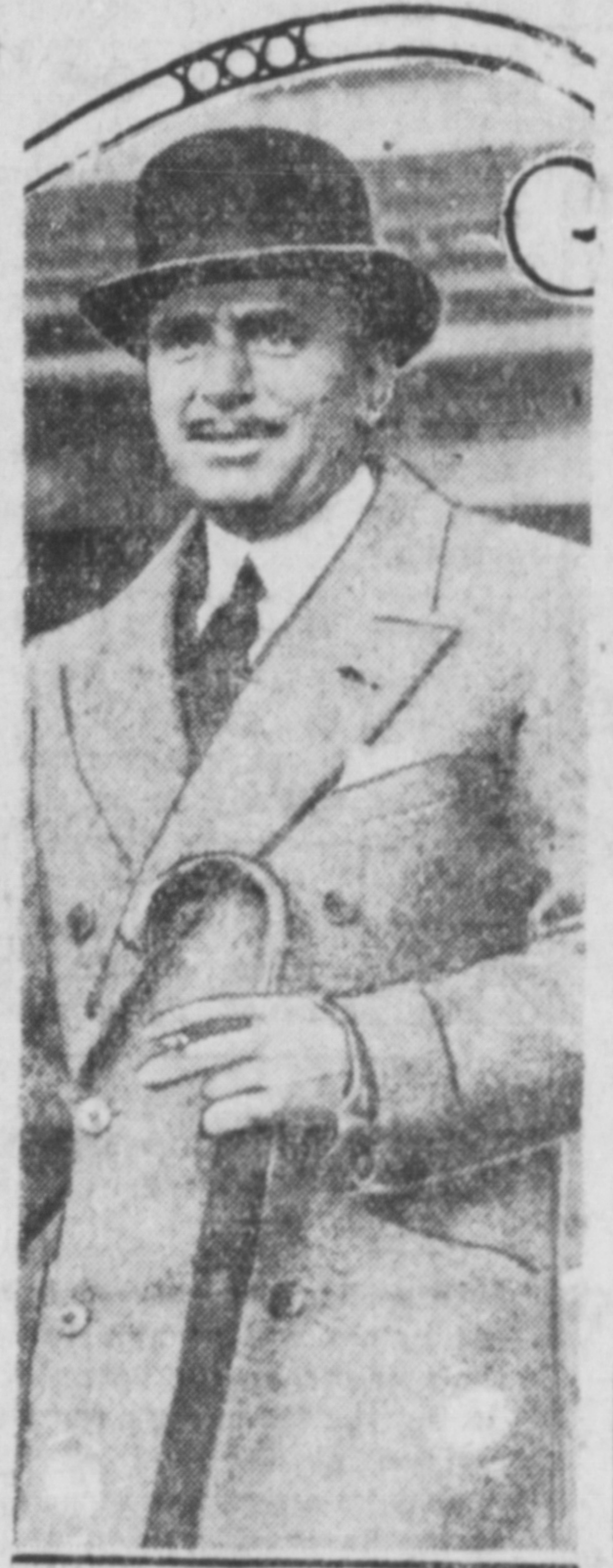
Douglas Fairbanks, popular screen star, who accompanied the Walker Cup team to England, lands in good order at Plymouth after crossing ocean.

Lefty O'Doul's single in the tenth inning gave the Phillies a decision over Pittsburgh Pirates.