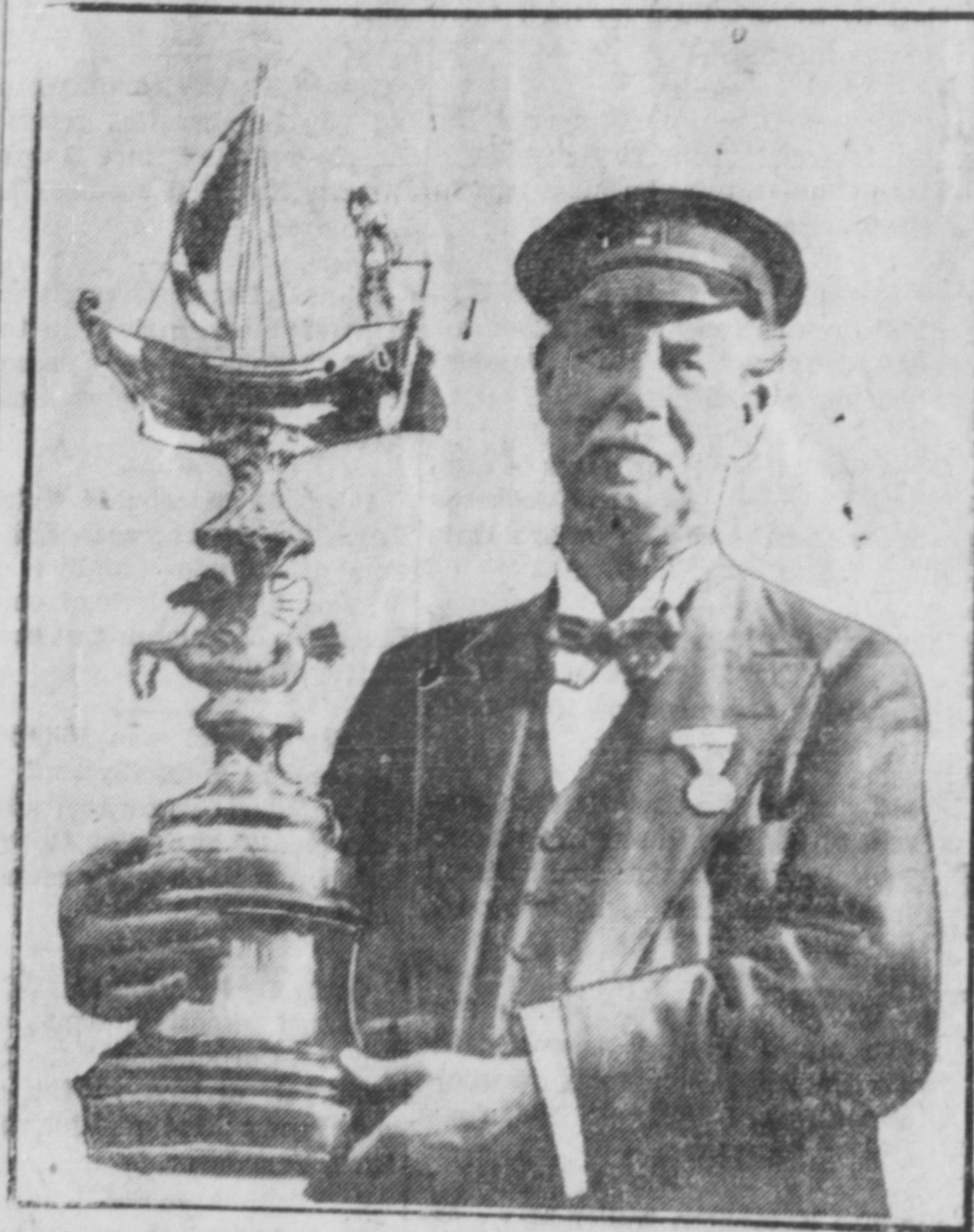
Who will make another attempt to capture America's Cup. Here he is seen holding the famous trophy.