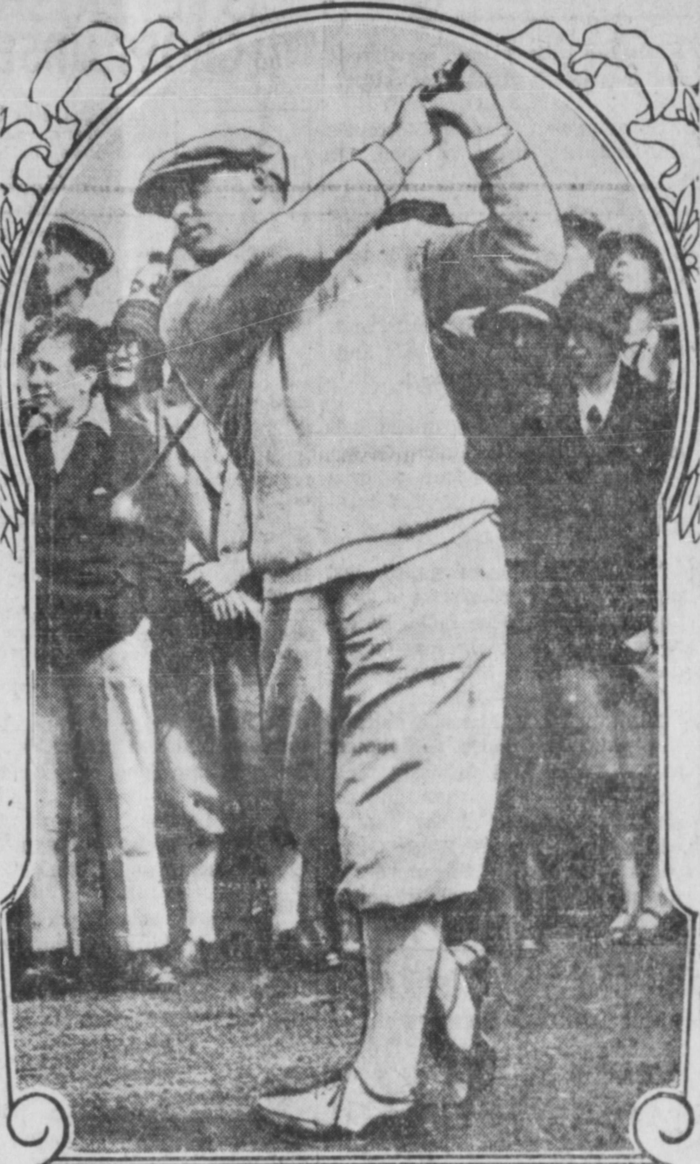
Bobby Jones, shown here, America's foremost golfer, finally achieved his ambition by winning British Amateur crown at St. Andrew's Scotland, from Roger Wethered. Yesterday he added to his laurels by winning for the third time the British Open Professional Golf Championship.