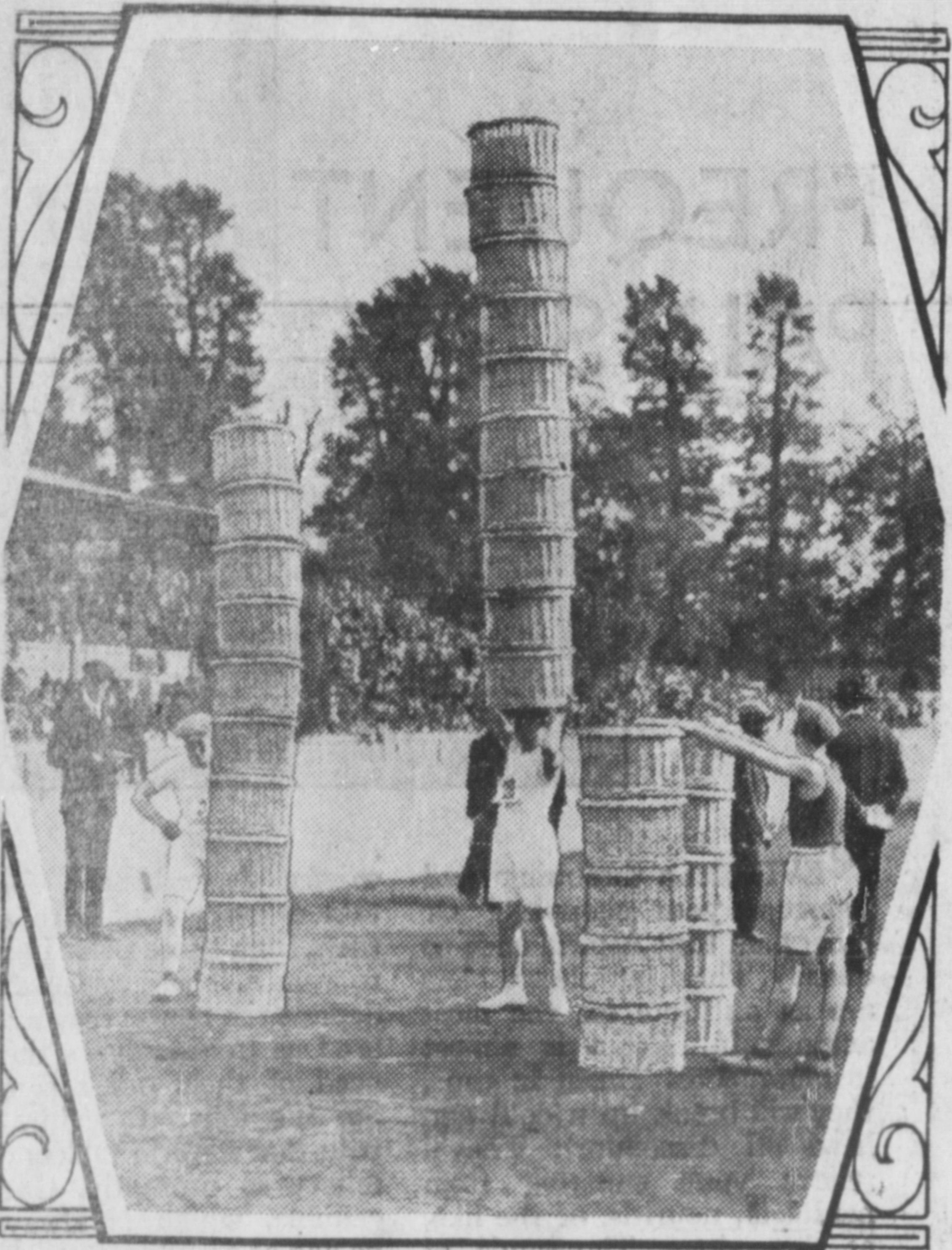
Scene during final of bushel basket championship race at recent Borough Market and South London fruiterers' annual sports at Herne Hill.