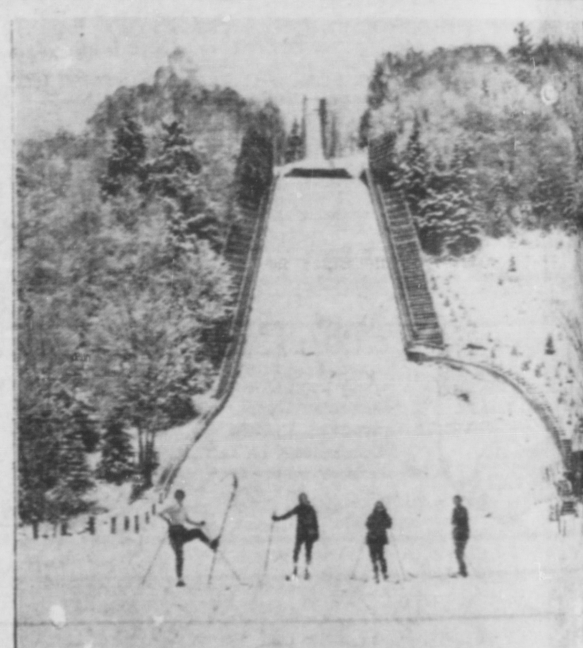
View of ski jump at Lake Placid New York, where 1932 Winter Olympic ski events will be staged.