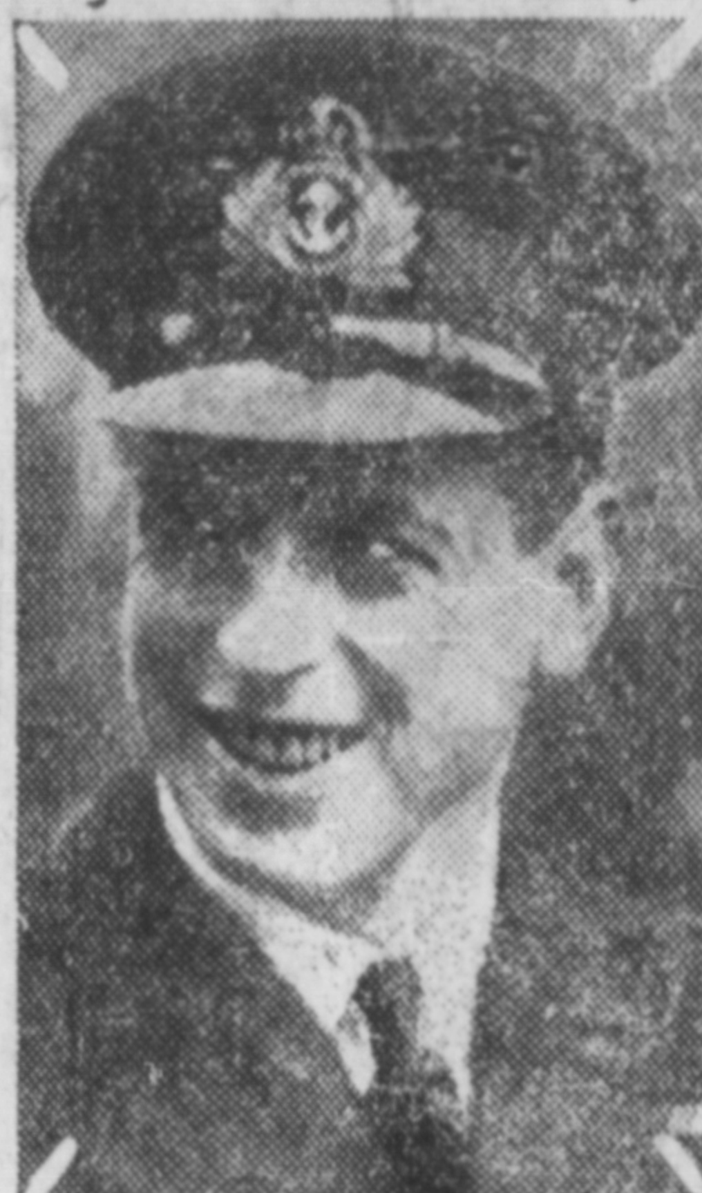
Prince George who received severe shaking up on being thrown from his horse while hunting.