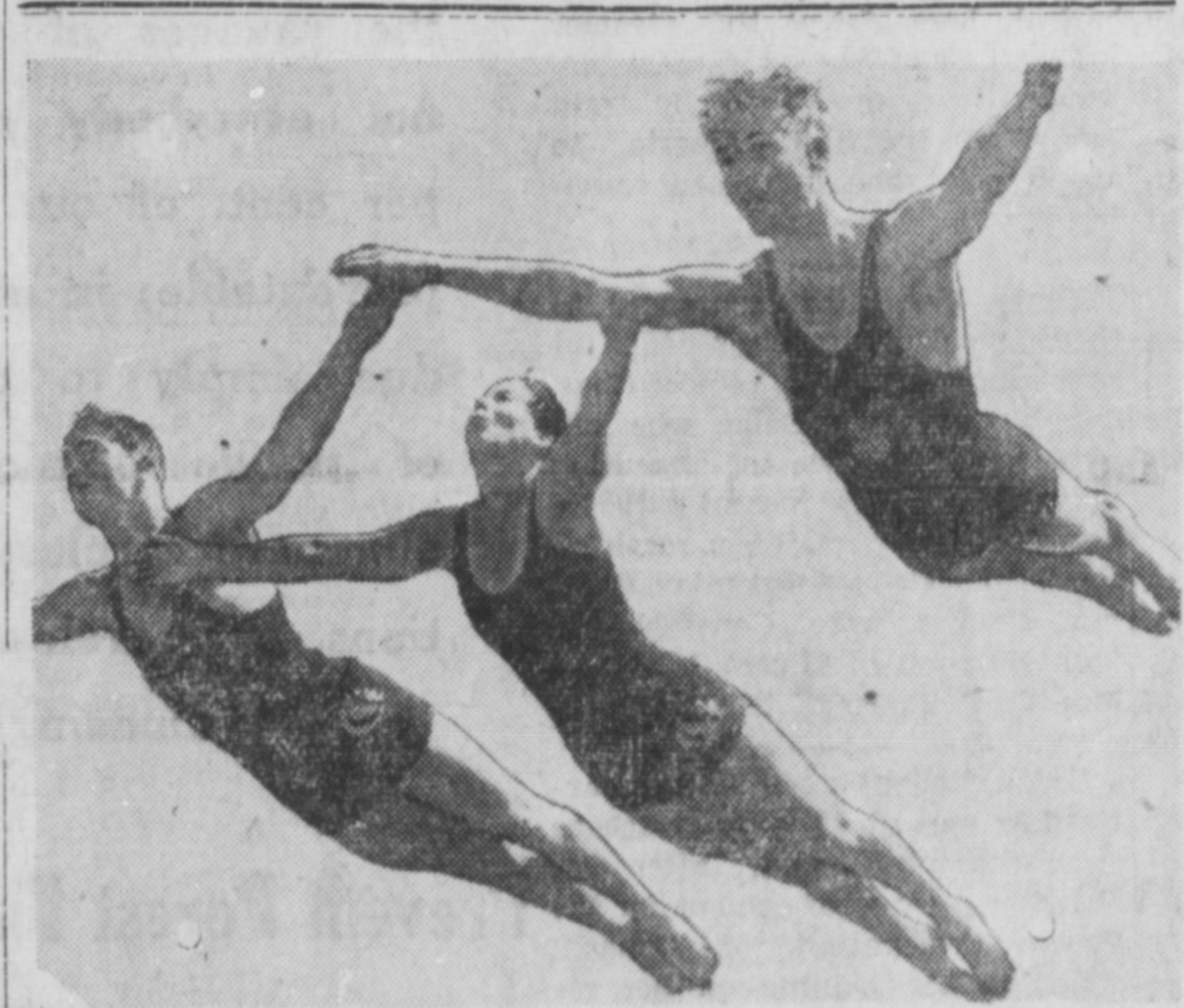
Three members of Los Angeles Athletic club performing spectacular triple dive. They are training for national A.A.U. outdoor championships contest at Long Beach, Calif.