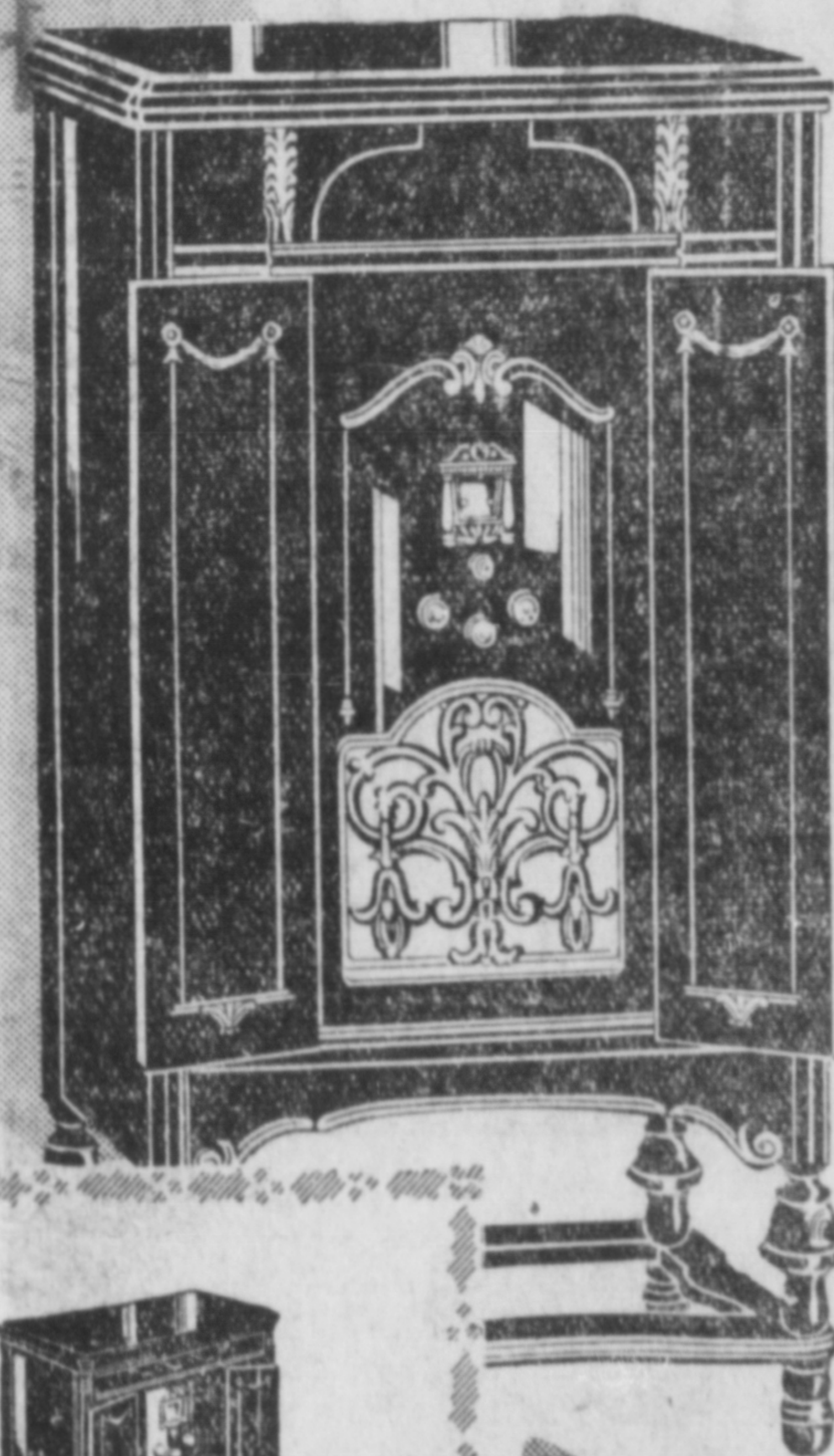
THE RADIO PHONOGRAPH $397.50