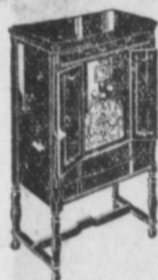
THE HIGHBOY $275