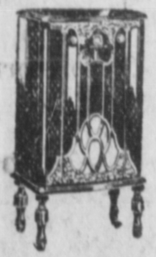
STUDIO LOWBOY $159

YOU will make this a memorable Christmas if your gift to the family is a General Electric Radio... the product of twenty million dollars radio research in General Electric's "House of Magic".