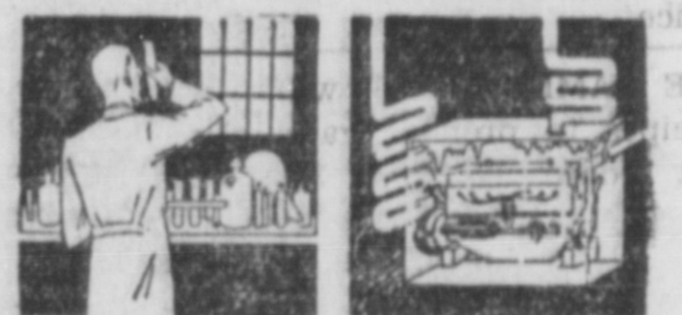
A Union Oil Technician making one of the 16 laboratory tests that check the 26% quicker starting ability of Winter Super Union.