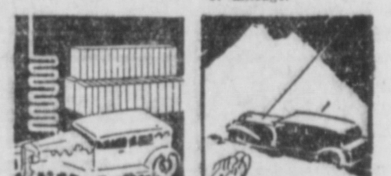
As a final check cars are run into the cold room of a great ice plant. These choke tests are made to verify its 26% quicker starting ability.