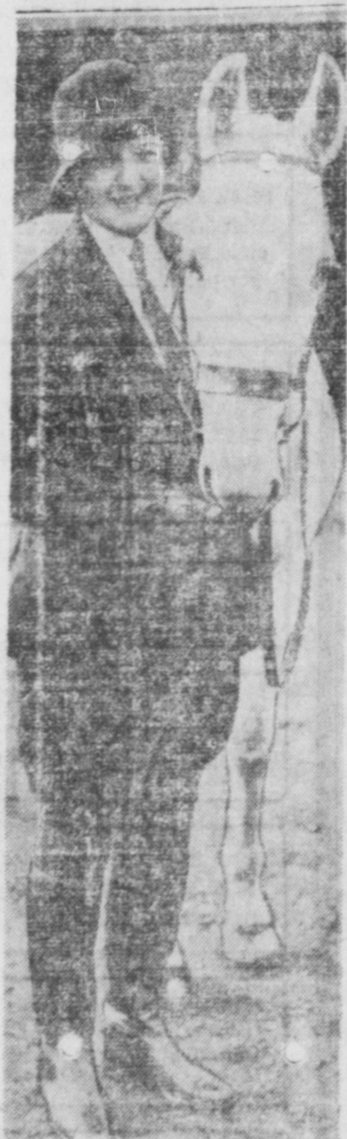
Miss Betty Nuthall, women's singles tennis champion of the world, as she appeared at Richmond, England, where she is taking instruction in horseback riding.