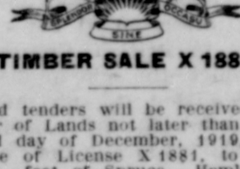
TIMBER SALE X 1881.

Further particulars of the Chief Forester, Victoria, B. C., or District Forester, Prince Rupert, B. C.