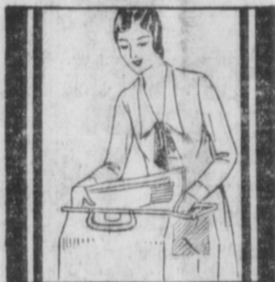
"John is going to be comfortable this trip"

Go to your favourite store today. Select the style and weight that suits you best. And remember Stanfield's costs you little or no more than ordinary underwear.