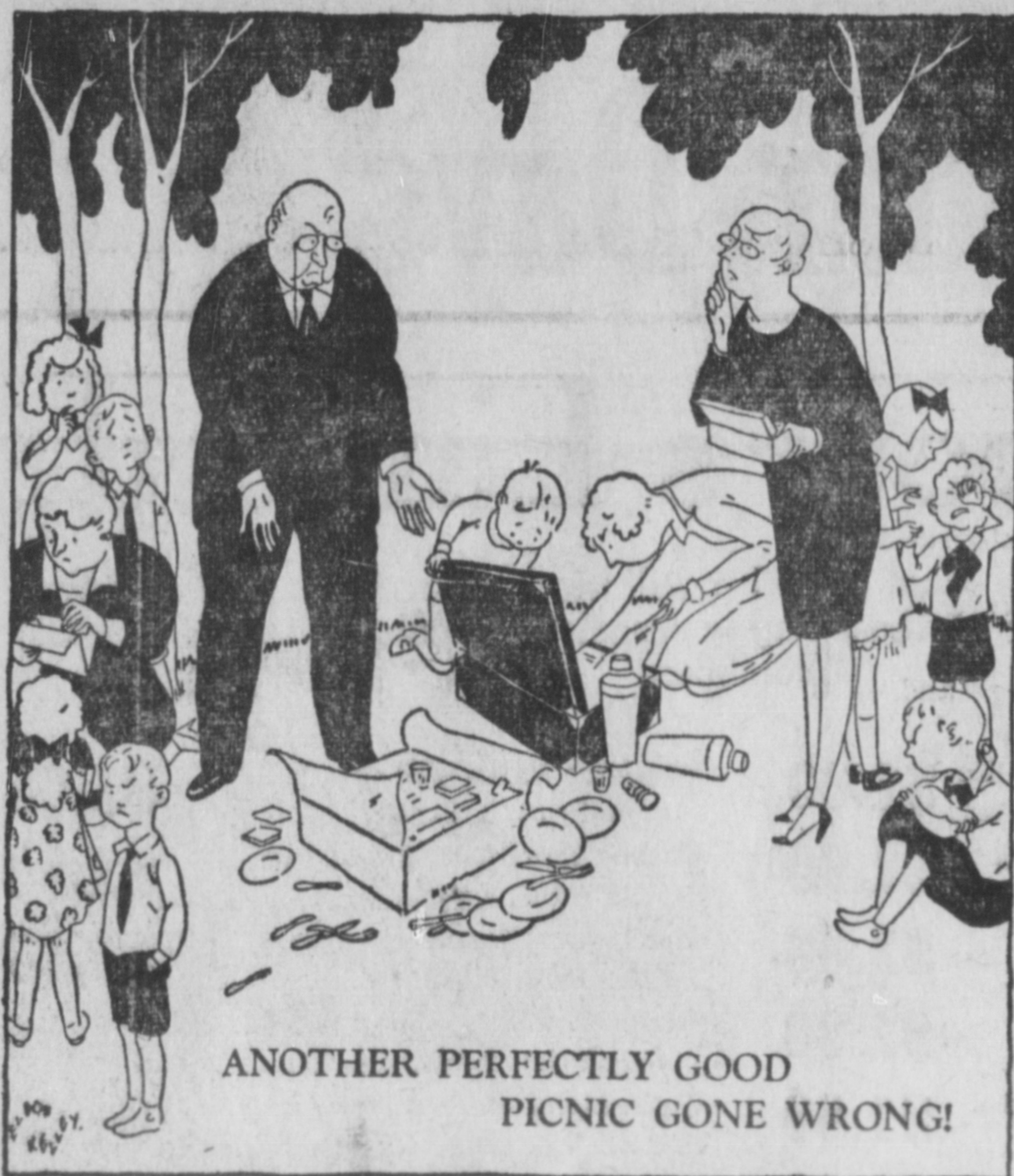
ANOTHER PERFECTLY GOOD PICNIC GONE WRONG!

SOMEbody has forgotten to put in the big package of Rowntree's York Milk Chocolate. Aunt Mary (extreme left) is suspected, but nobody can find the heart to accuse her. Little Bartholomew (seated, with arms crossed, at the right) felt all along that something was going to happen to spoil the day.